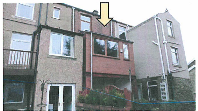
Figure 2: rear elevations