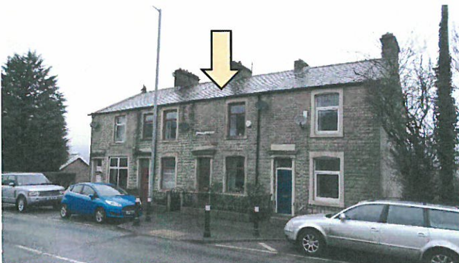
Figure 1: front elevation – Ebenezer Terrace

(1) Rear extension above first floor flat roof extension; faced to match the existing brickwork. (2) Ground floor single storey extension with mono slate roof and Velux skylight. (3) Removal of existing flat bitumen roof and fascia. ( Reference: Drawings of proposed elevations and plans, Khalid Khan Associates ).