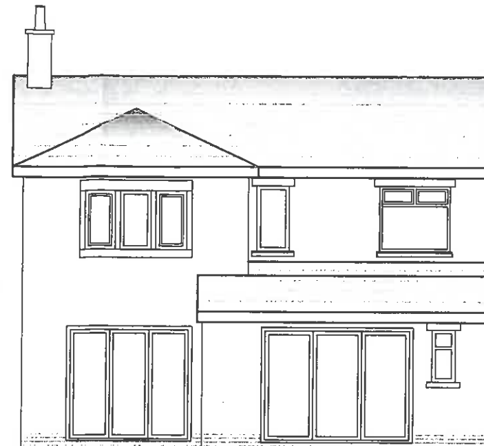
As Approved Rear Elevation