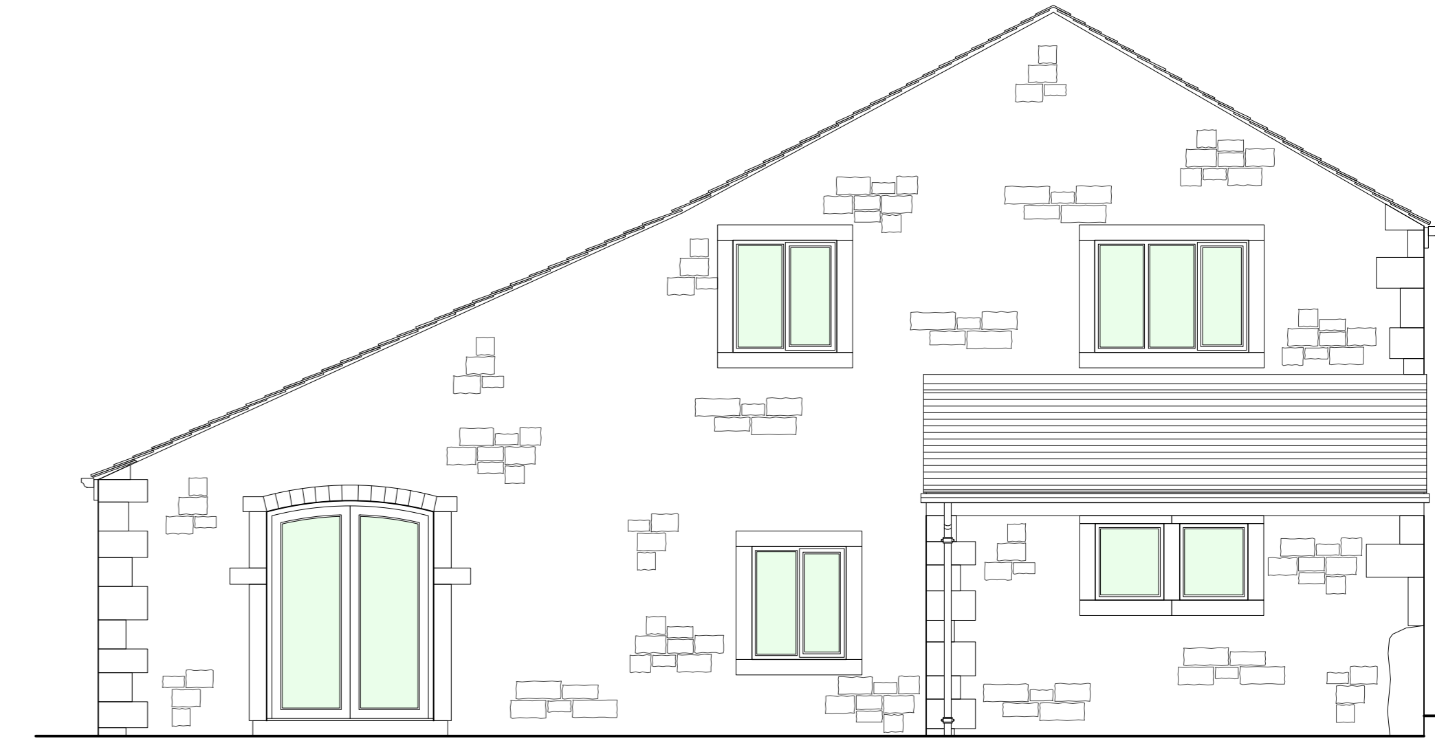
Gable Elevation (South West)