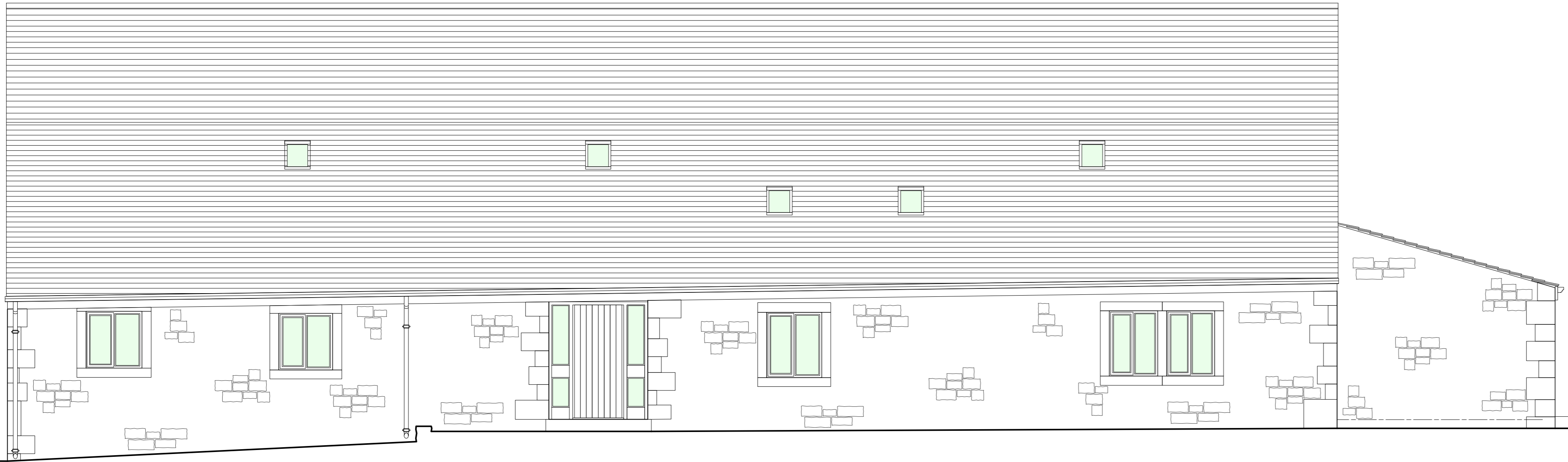
Front Elevation (North West)