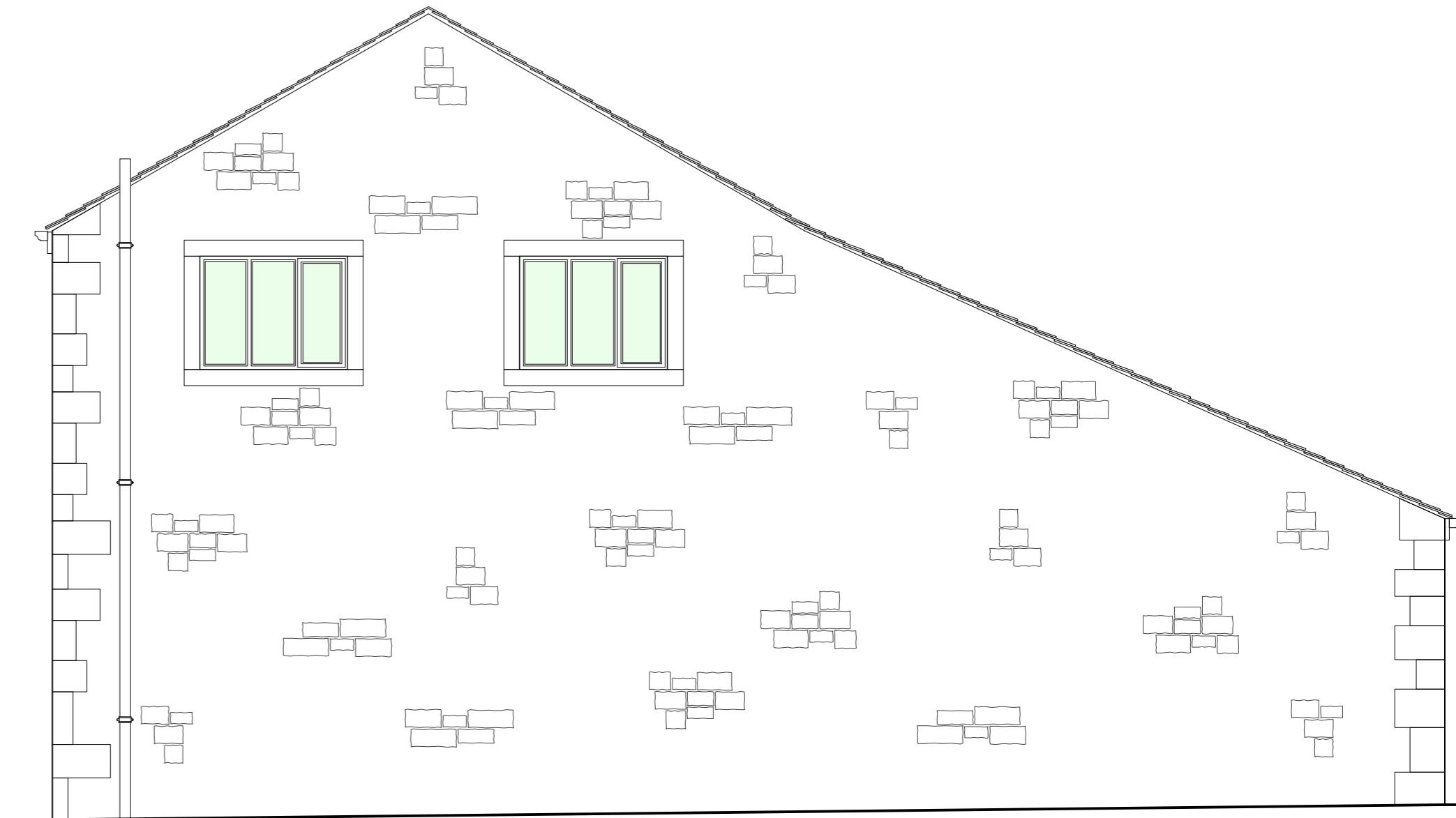
Gable Elevation (North East)