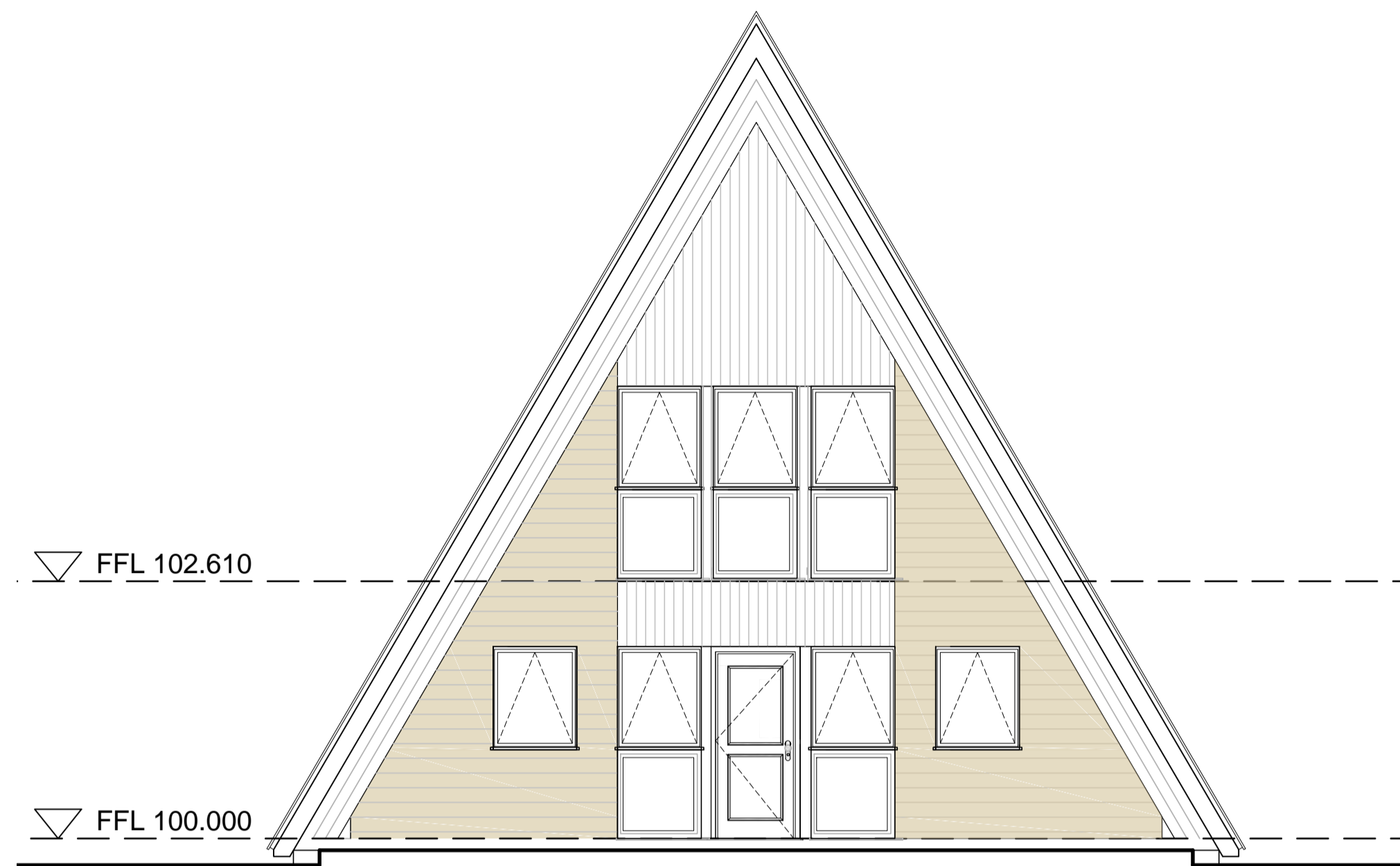
SIDE ELEVATION 1:50