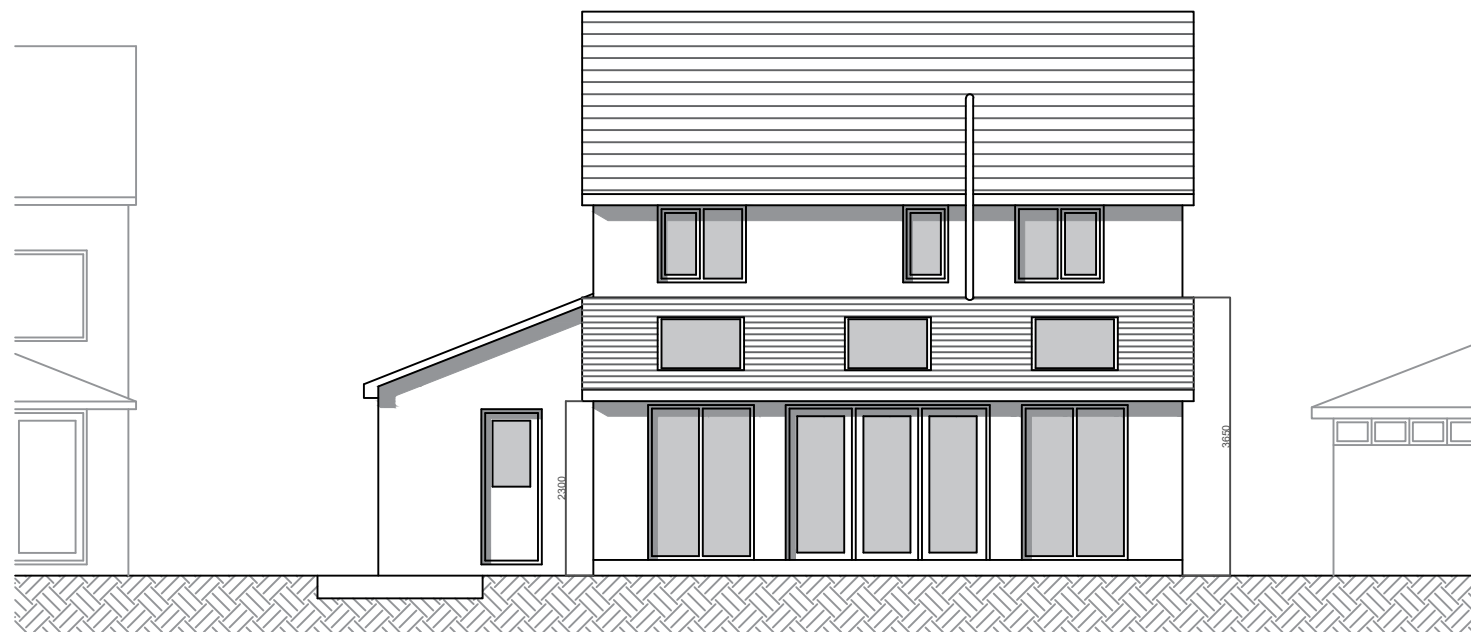
PROPOSED SOUTH-EAST ELEVATION