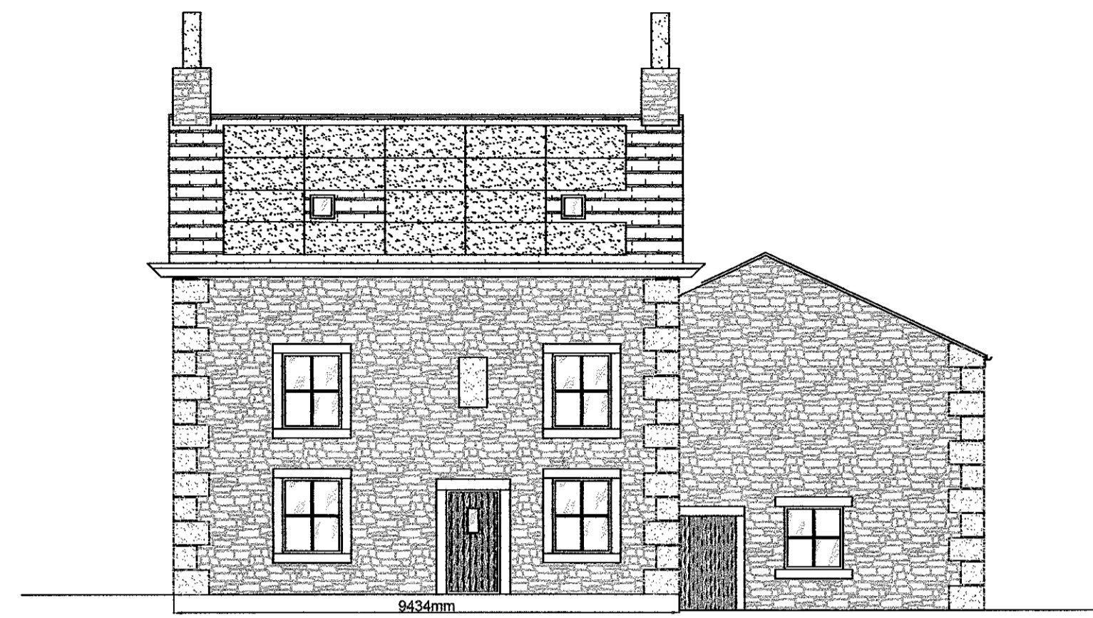
FRONT ELEVATION (South)