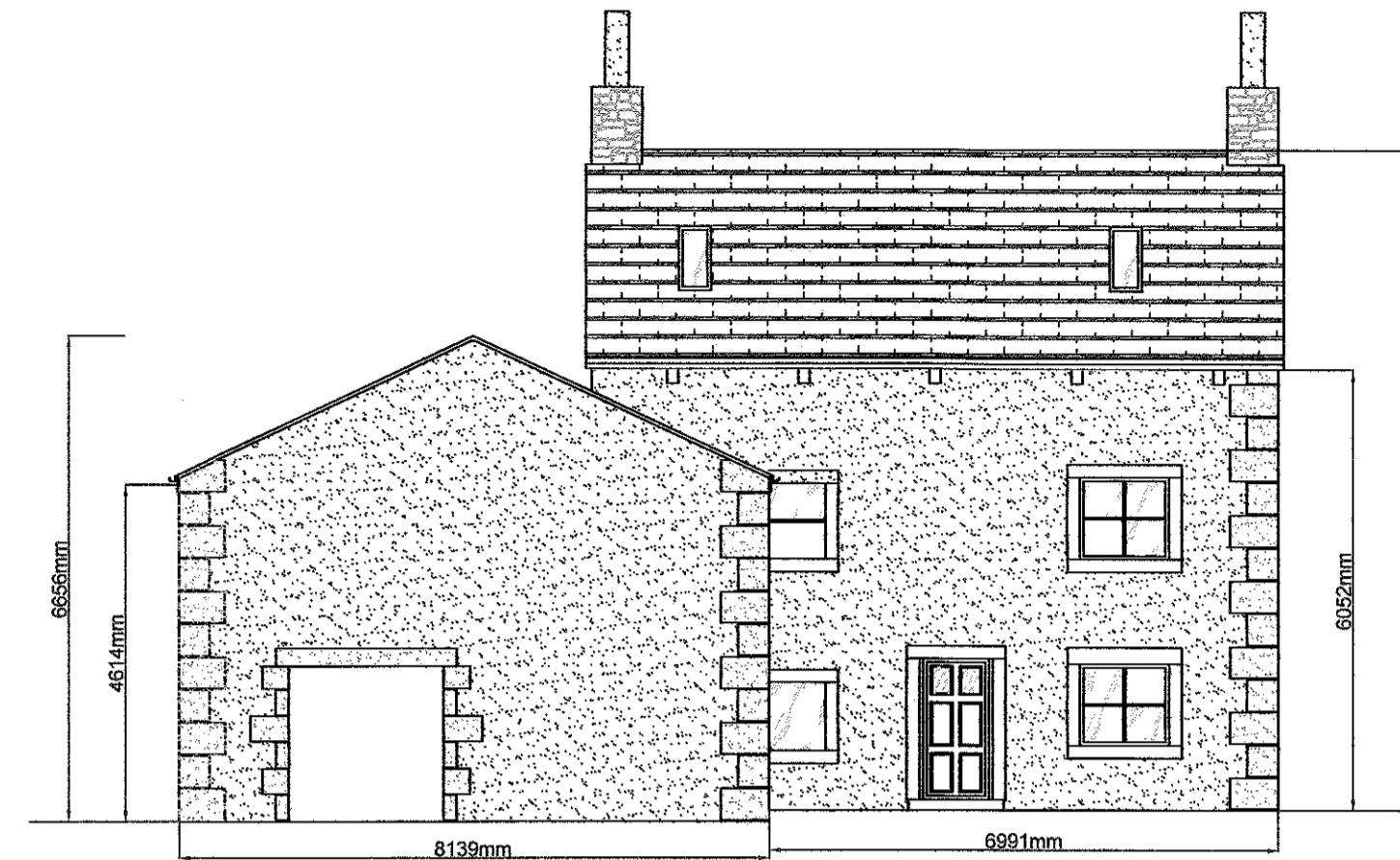
REAR ELEVATION (North)