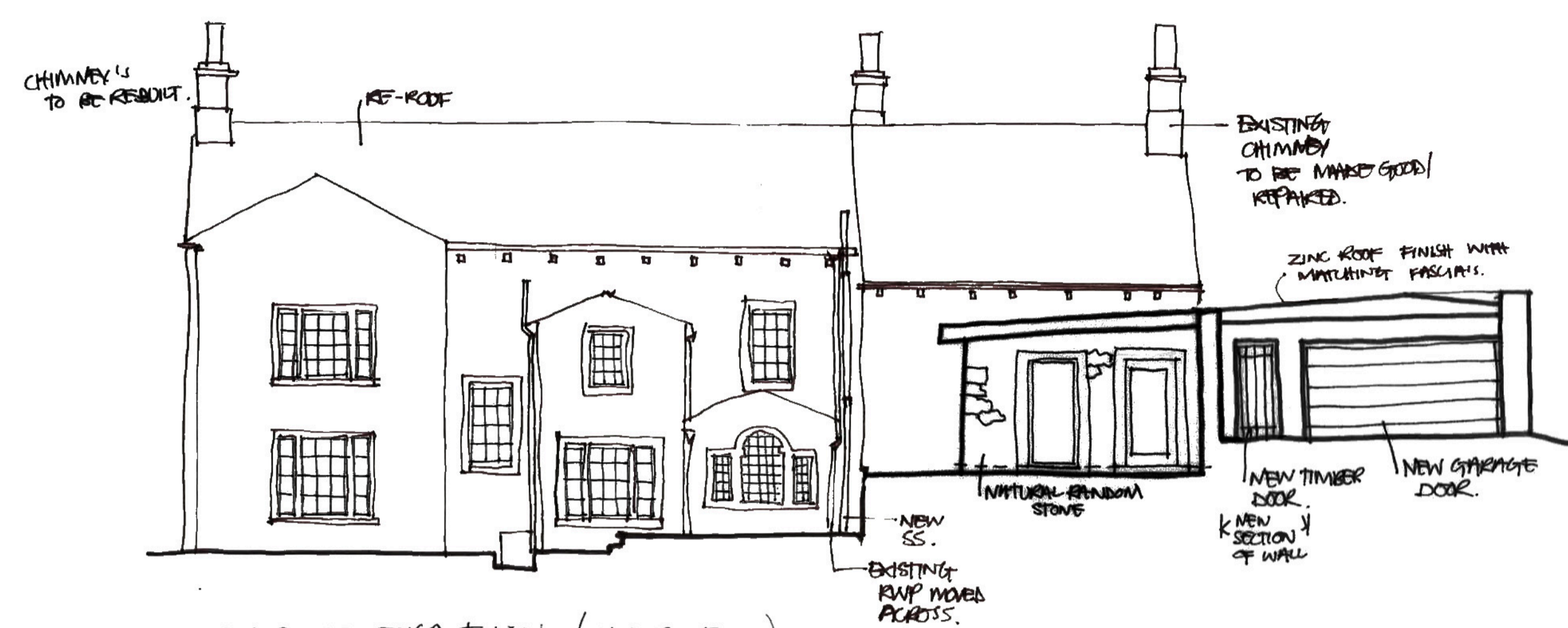
REAR ELEVATION (NORTH)