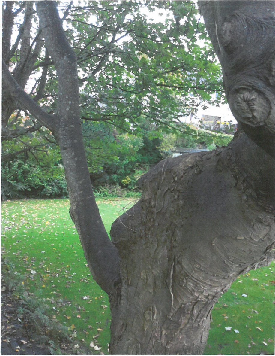
Tree (A) higher section of trunk