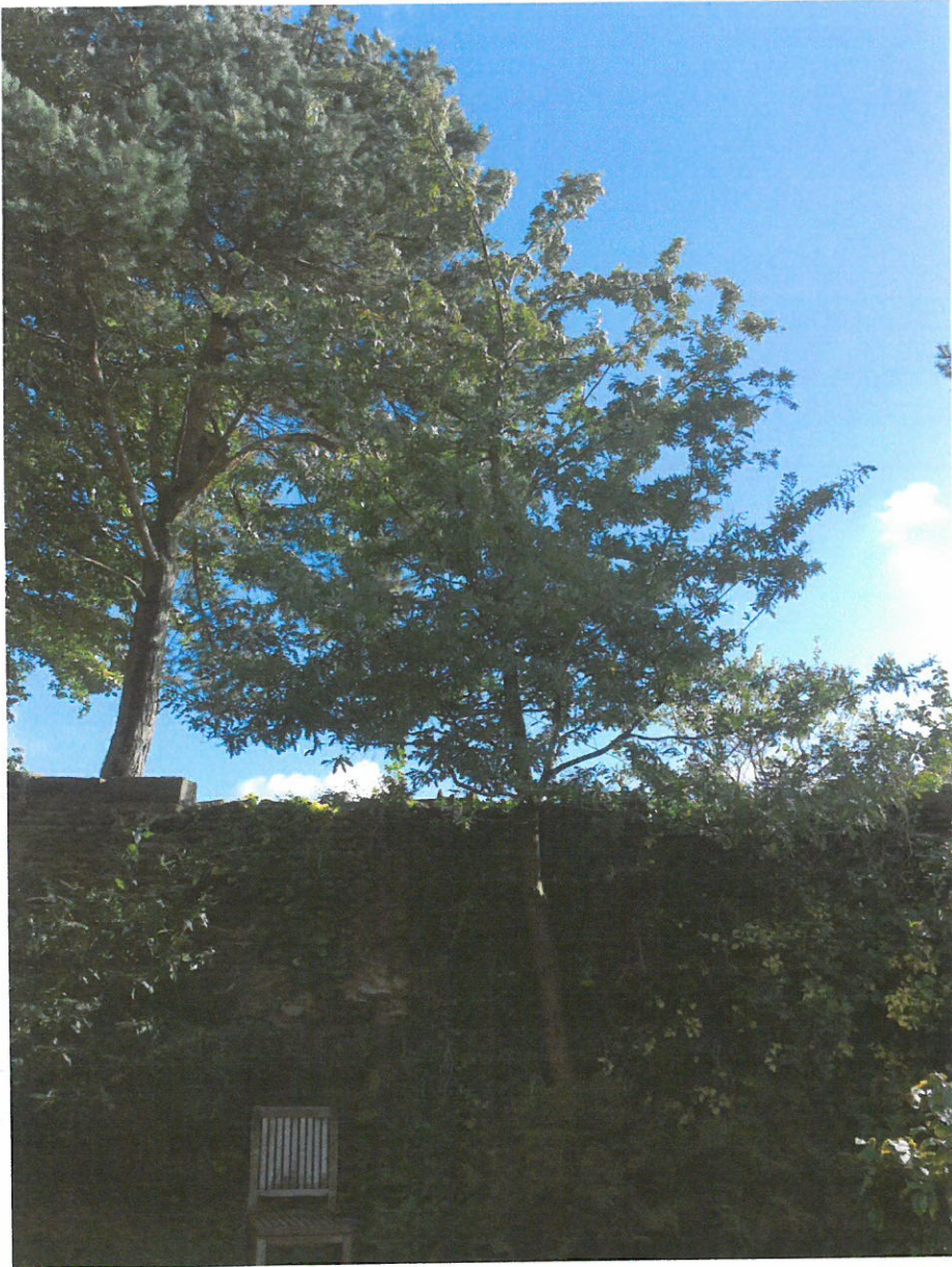
Oak tree marked (B)