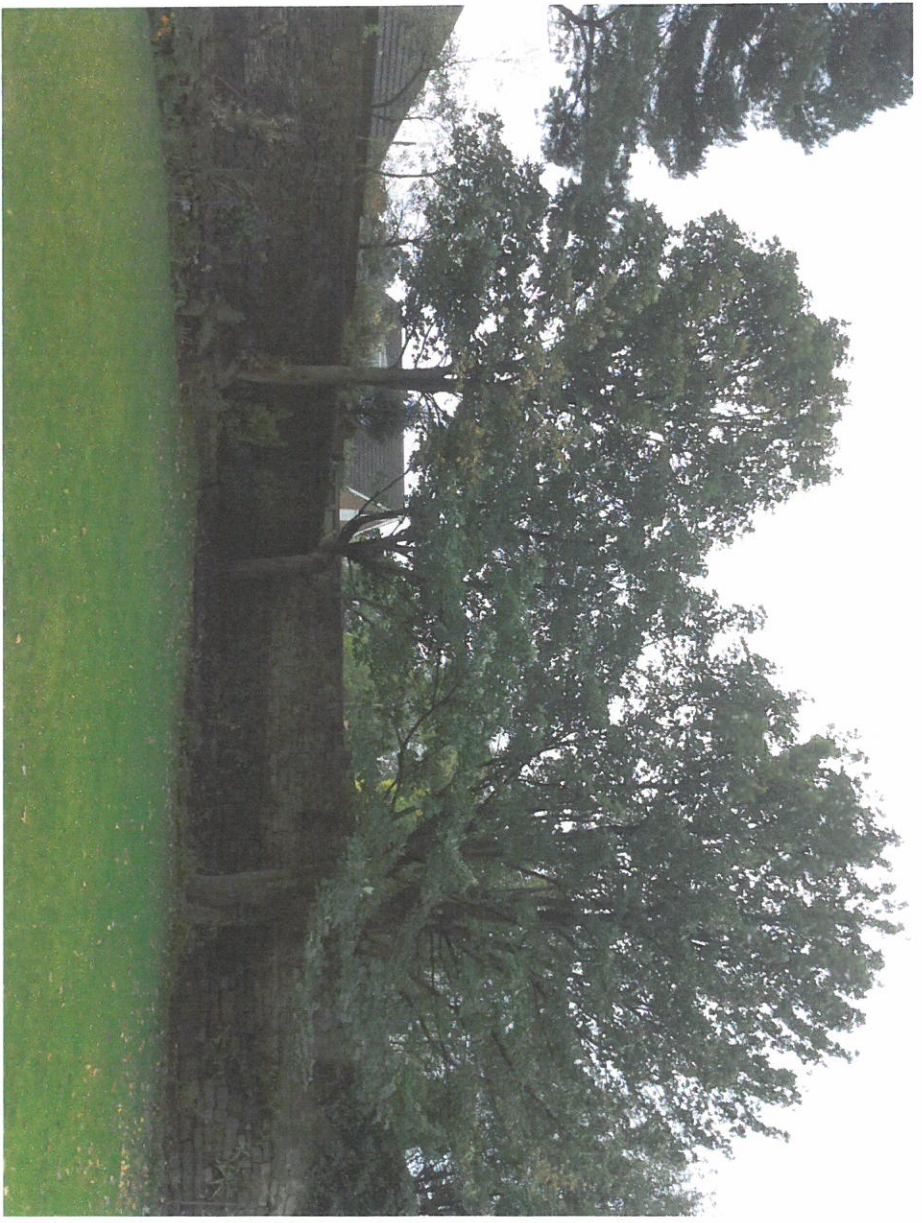
General view - tree ① in the centre