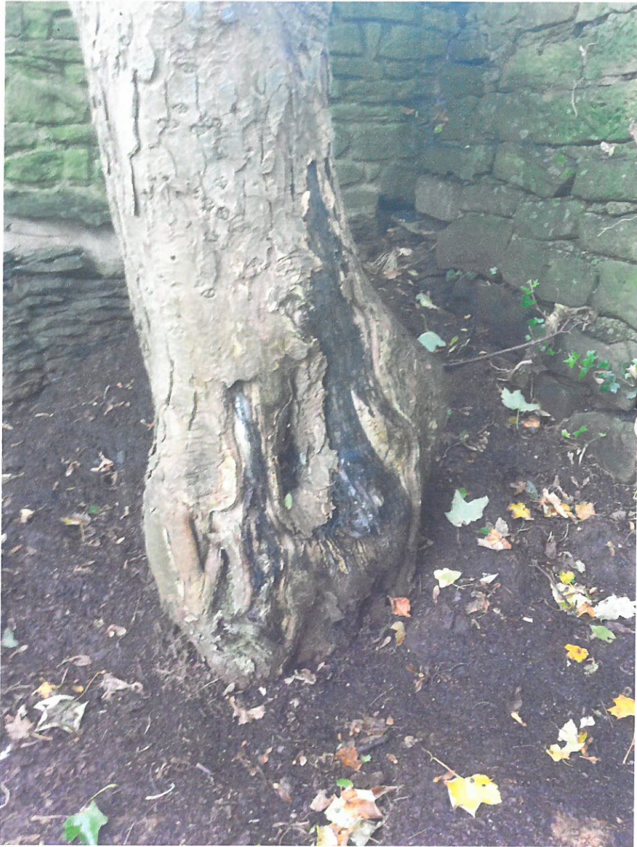
Tree (A) - bottom of trunk