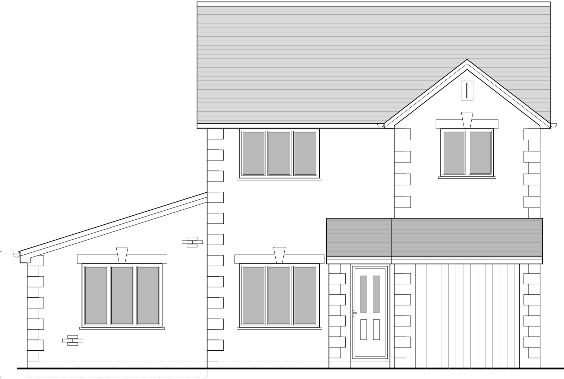
EXISTING SOUTH WEST ELEVATION Scale 1:50