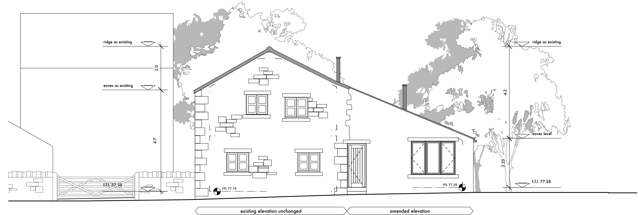
north west elevation

B Issued for variation Nov 2017 A Issued for planning Sept 2014 - Issued for information May 2014