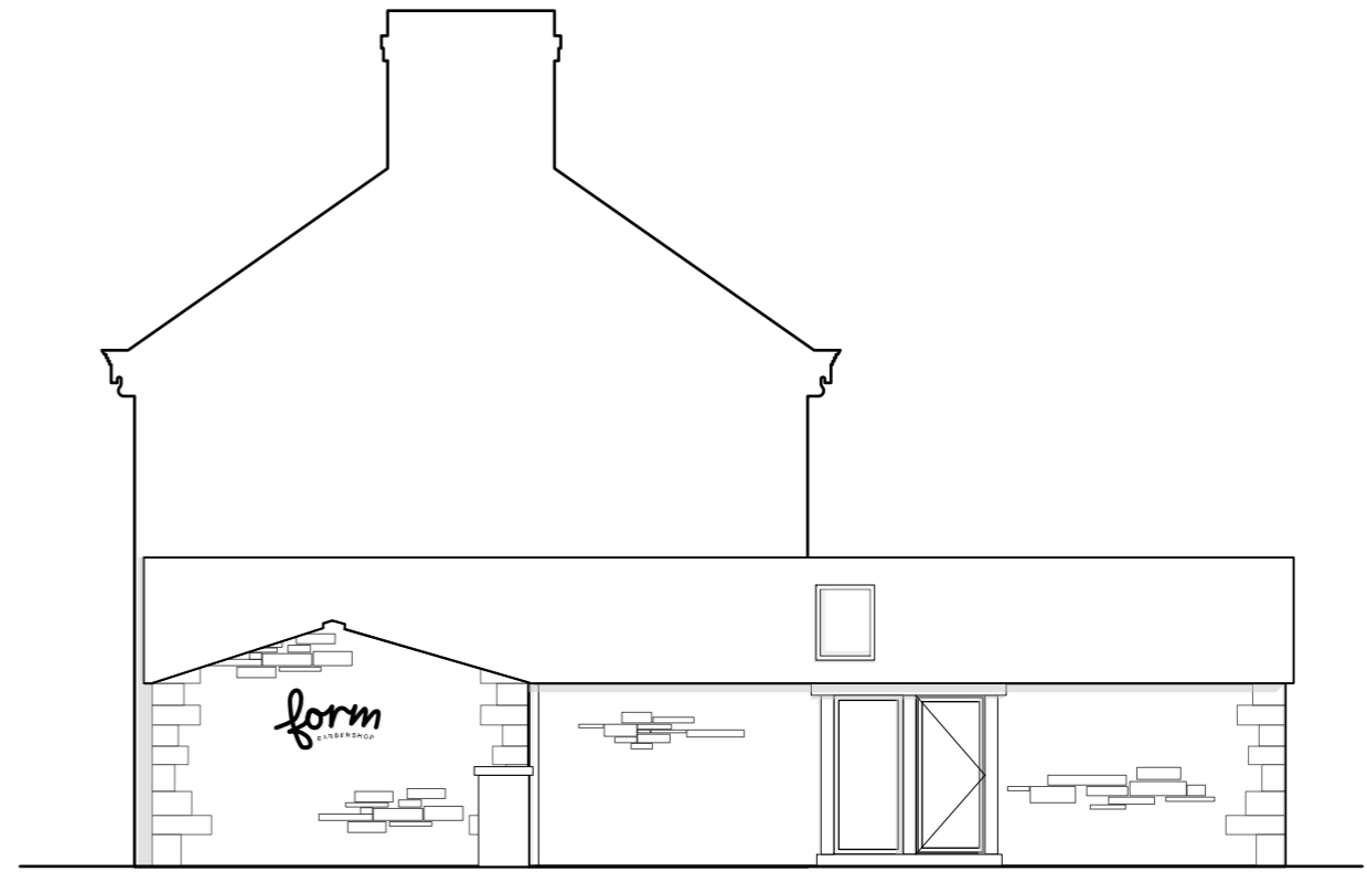
2 Front Elevation