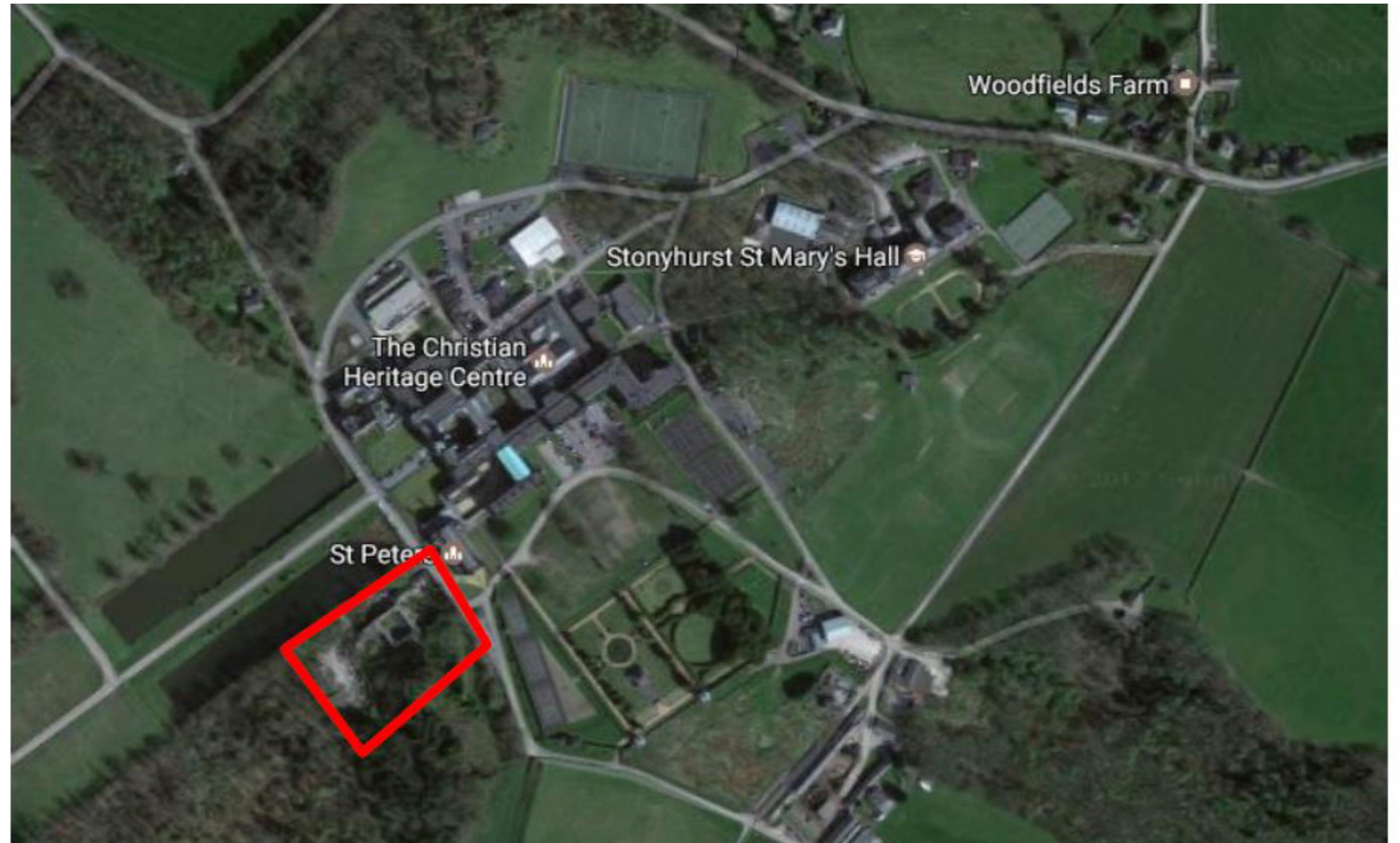
Fig 1. Site Location

As shown on Fig. 2 the site is located within the Forest of Bowland AONB and Stonyhurst's Historic Parks and Gardens.