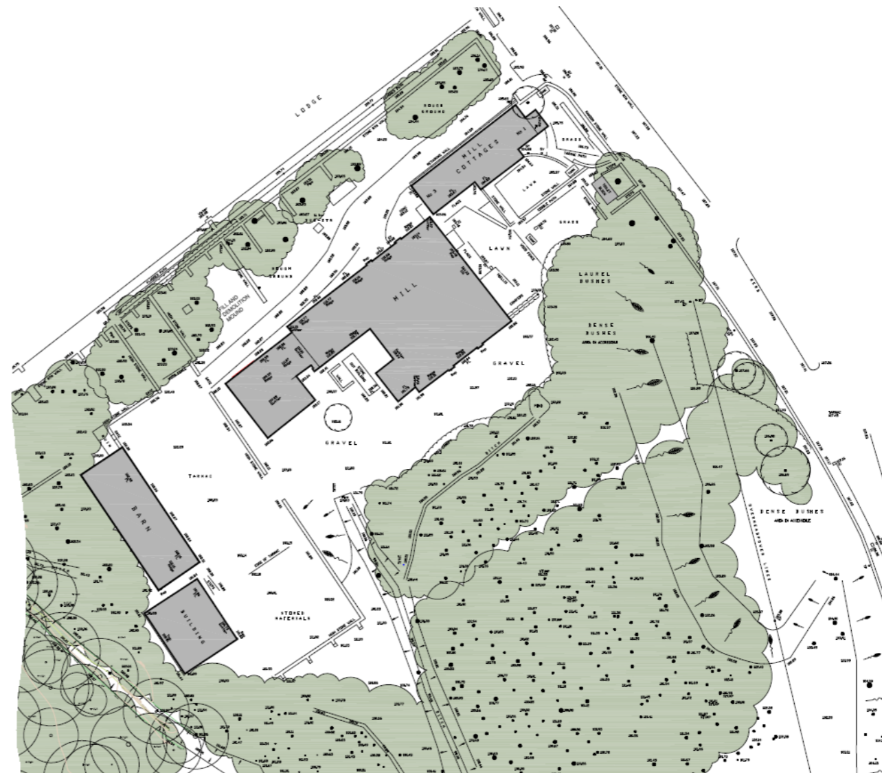
Fig 3. Existing Site Plan (extract from dwg no. 7744-E02)

The primary stage for the building of the Mill was the late eighteenth and early nineteenth century. In the later nineteenth century the building was extended and a steam engine installed but by the twentieth century the building was disused and had fallen into disrepair. The roof was removed and wall tops consolidated after partial collapse in 2010. Following this, it was considered that the building was at risk as it was now a roofless shell and unsafe for access or inspection although some consolidation did take place. It was advised after this that alternative uses for the building should be sought and for this reason, the site was considered as the location of the new retreat centre and a full planning and listed building consent application for its conversion and restoration was originally approved in 2016 with subsequent applications approved in 2017.