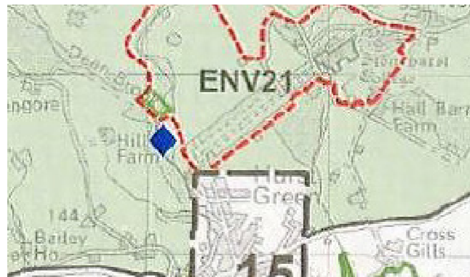
Fig 2. Extract from Ribble Valley's Local Plan Proposals Map