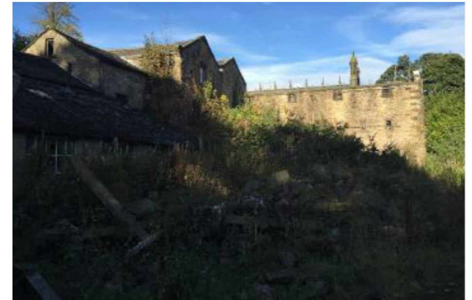
Fig 5, 6, 7 and 8. Photographs of The Old Mill and its surrounds