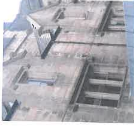
Elevation Five - E5