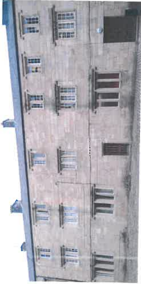
Elevation Two - E2