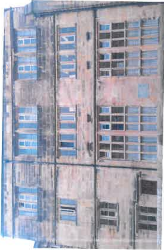
Elevation Six – E6