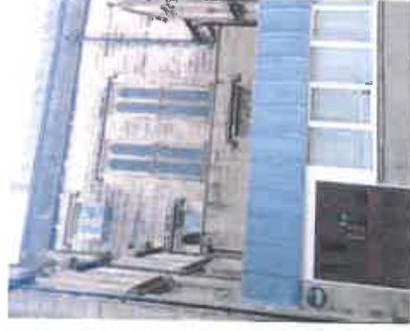
Elevation Four - E4