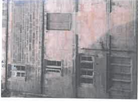
Elevation Seven – E7