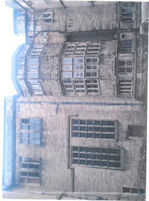
Elevation Eight – E8