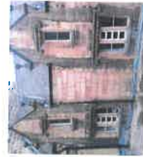
Elevation Three - E3