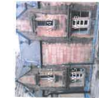
Elevation Three - E3