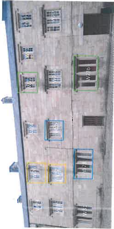
Elevation Two - E2