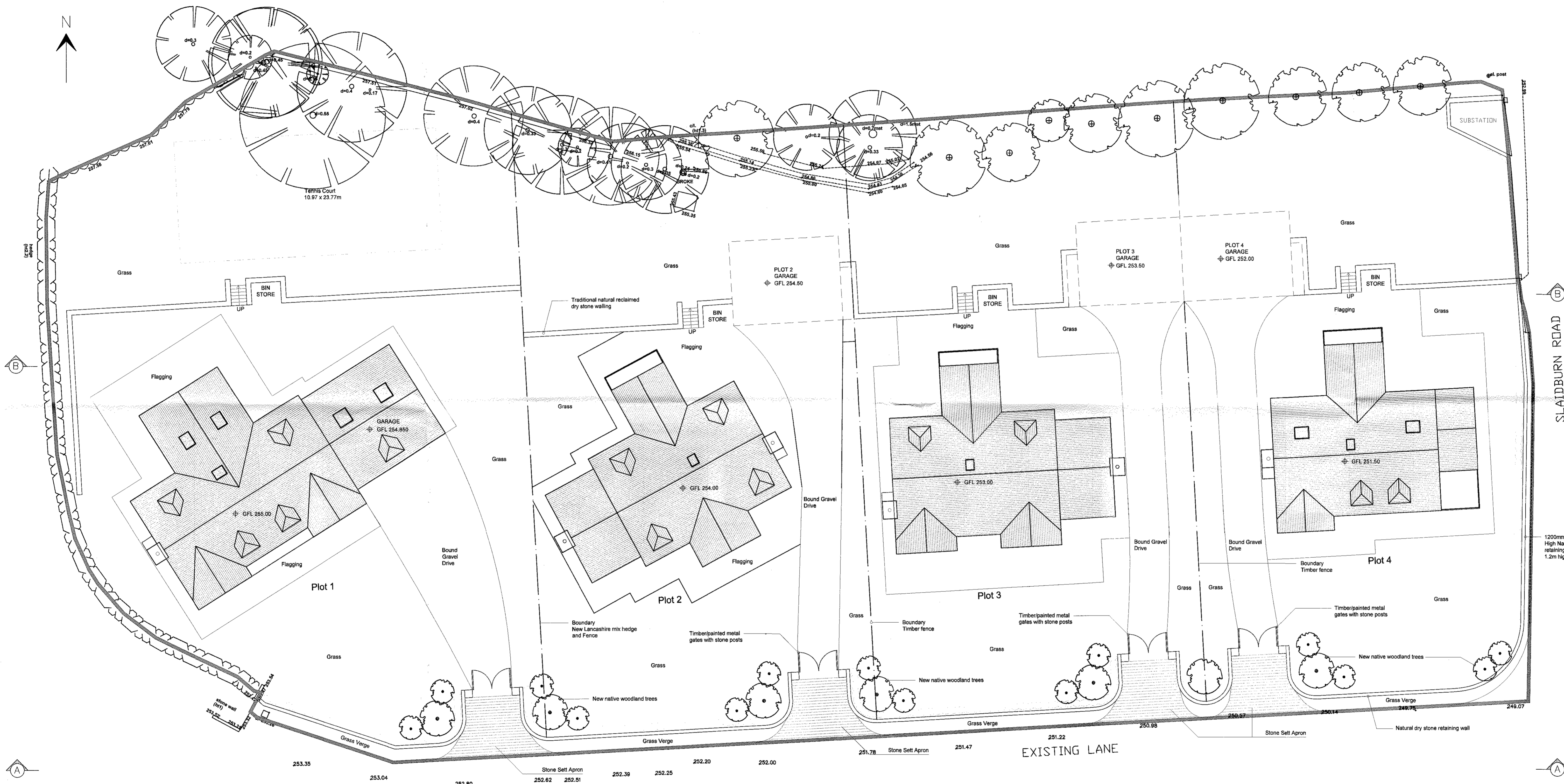
PROPOSED SITE PLAN Scale 1:200