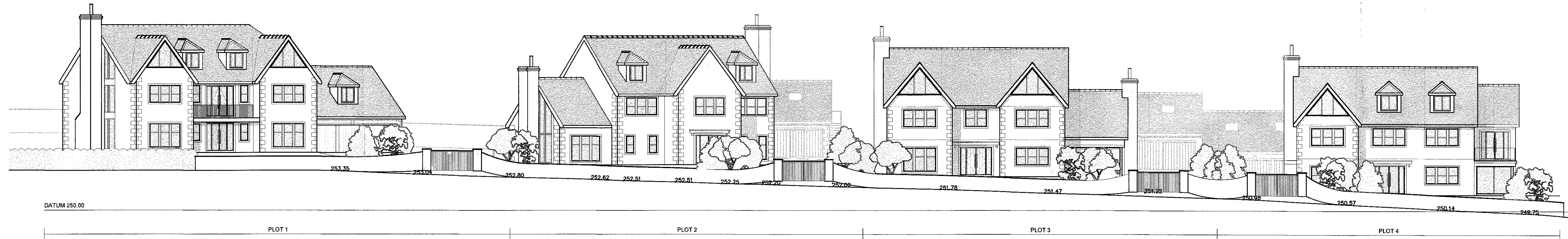
PROPOSED SECTION A-A Scale 1:200