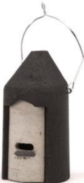
Figure 2 Schwegler 2F Bat Box x 2. Located on mature trees with openings facing South West. Positions indicated on drawing number 3335/100A.