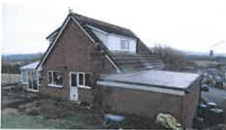
Figure 1: Rear (north) elevation

Images: 40 Eastfield Drive, West Bradford. (05/02/18)