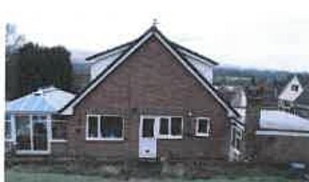
Figure 2: rear elevation