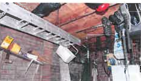
Figure 4: Garage internal