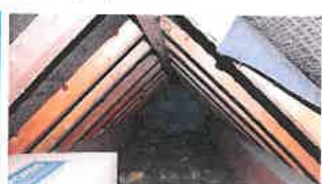
Figure 6: Roof void