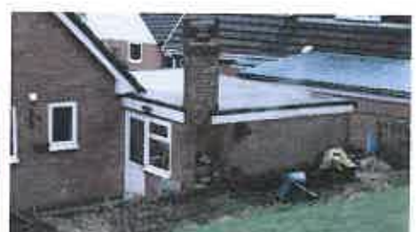
Figure 3: garage rear elevation