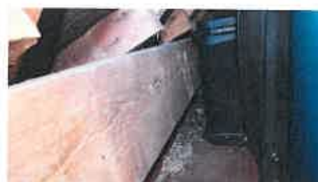
Figure 5: Roof void