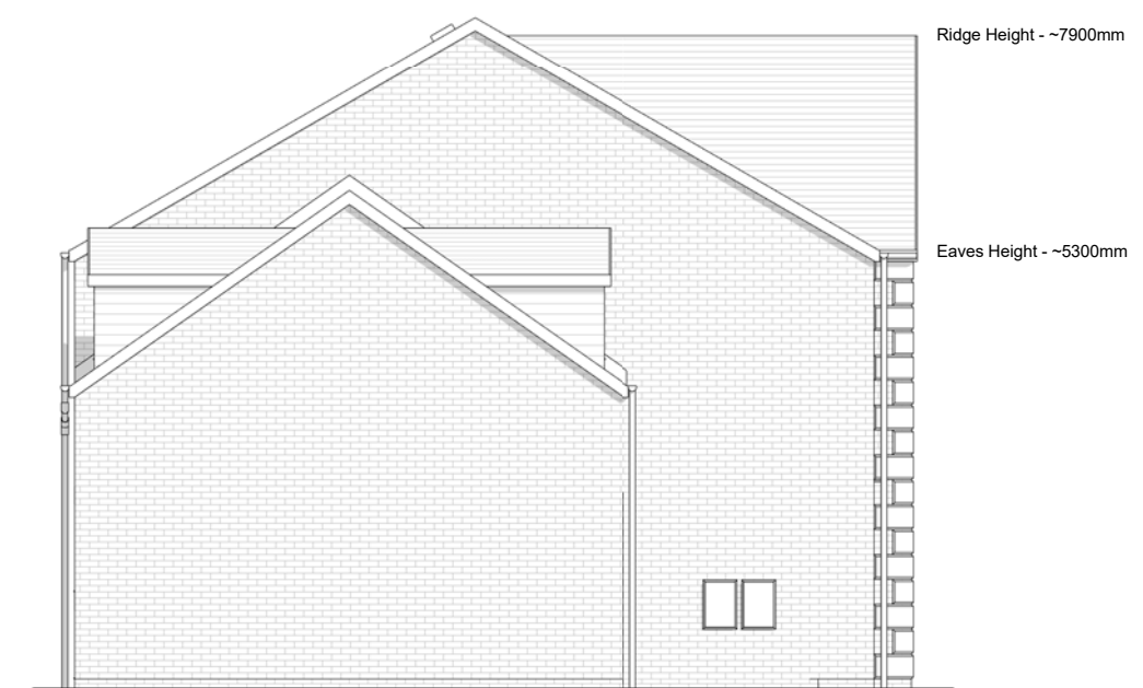
Left Elevation 1 : 100