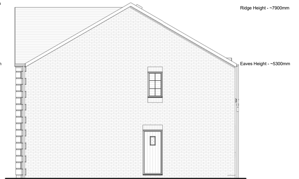
Right Elevation 1 : 100