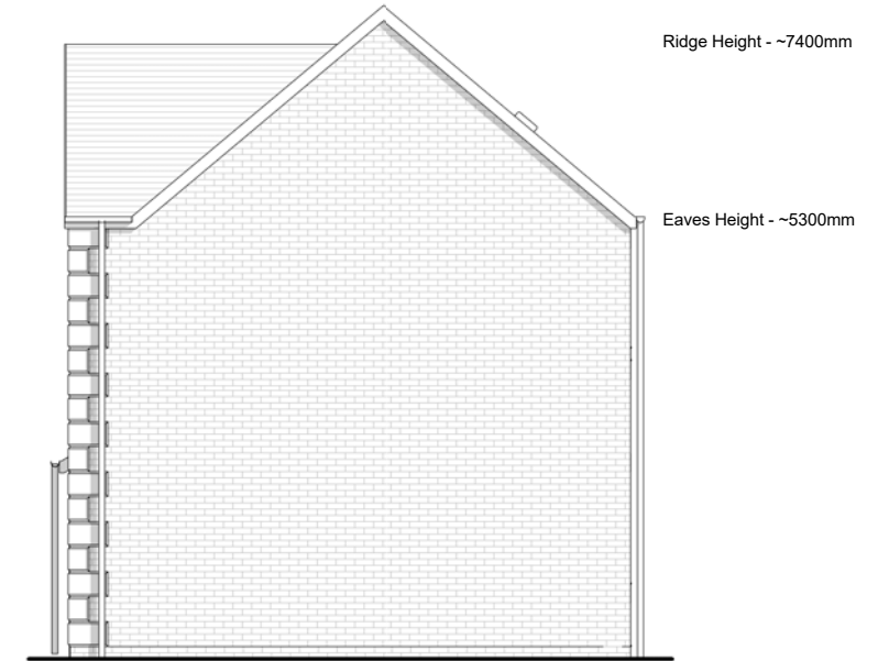
Right Elevation 1 : 100