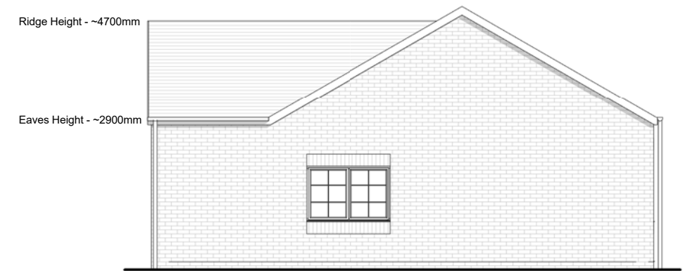
Right Elevation 1 : 100