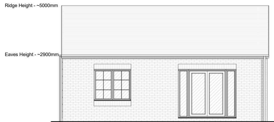
Rear Elevation 1 : 100