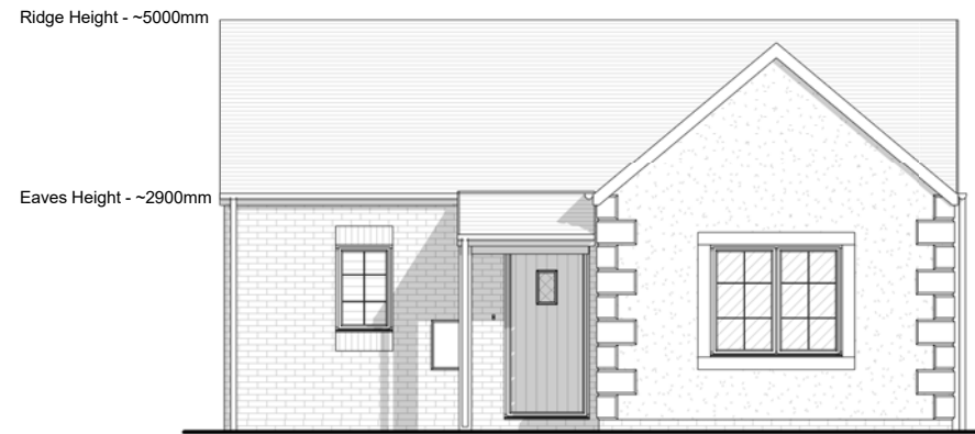
Front Elevation 1 : 100