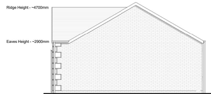
Right Elevation 1 : 100