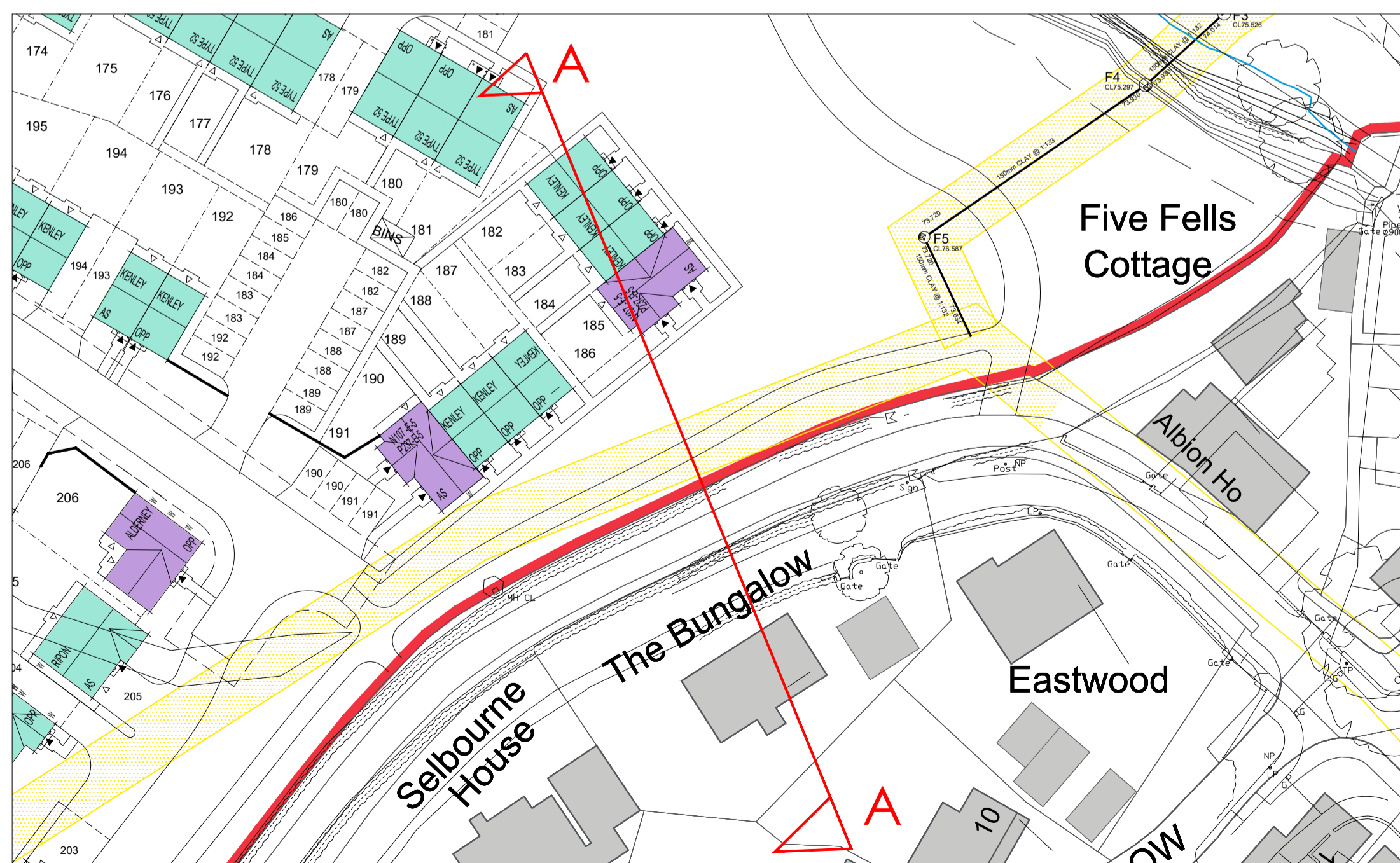
Section A-A Location Plan