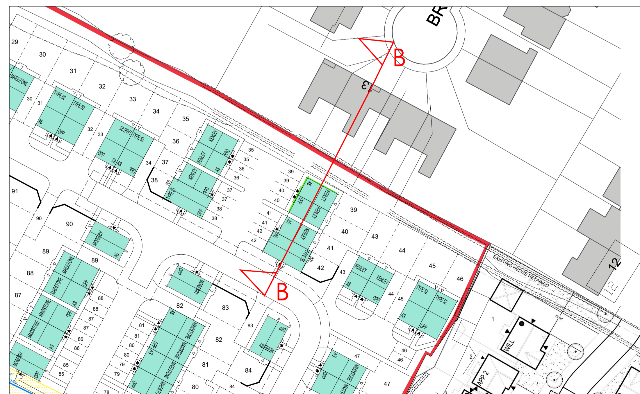
Section B-B Location Plan