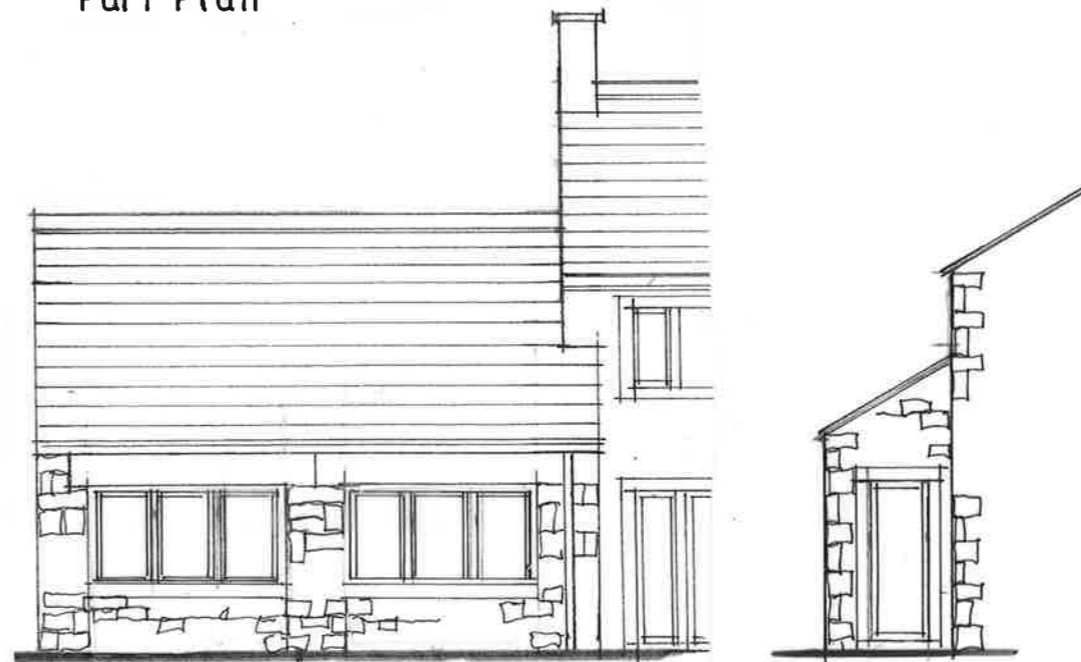
Part Front Elevation