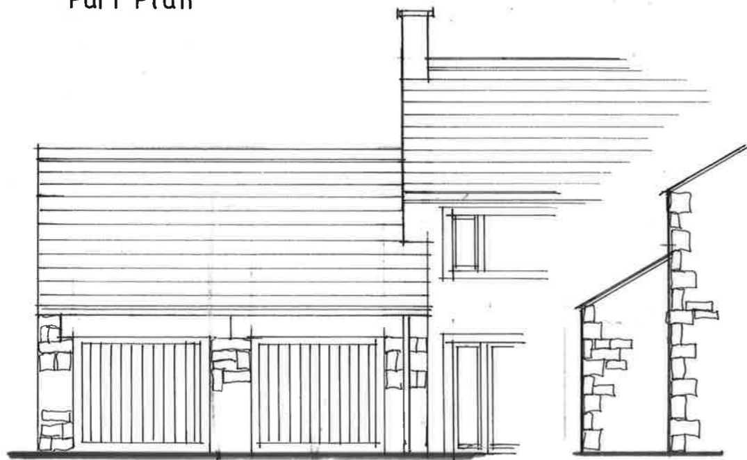
Part Front Elevation