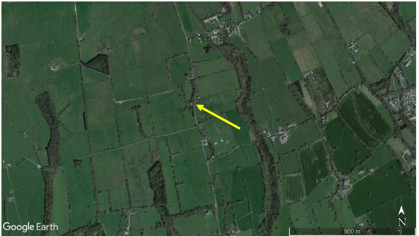
Figure 1: Location of property (Google Earth)

National Grid Reference: SD 722 452 Elevation: approx. 180 metres.