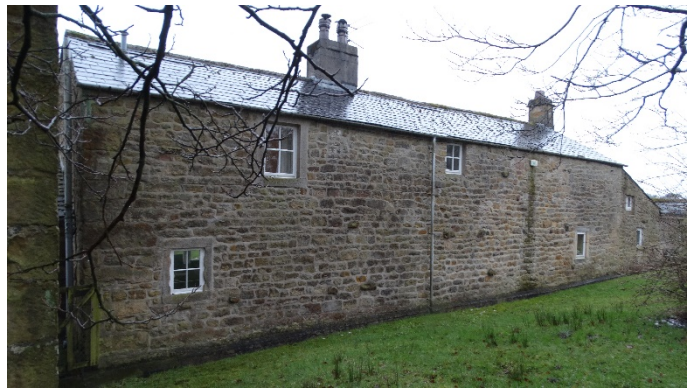
Figure 4: rear elevation (north)