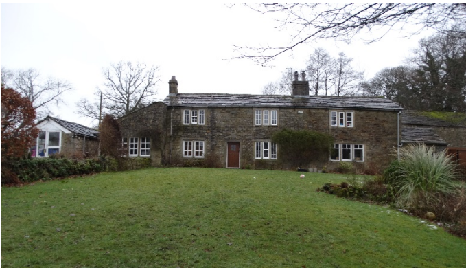
Figure 3: Front elevation (south)