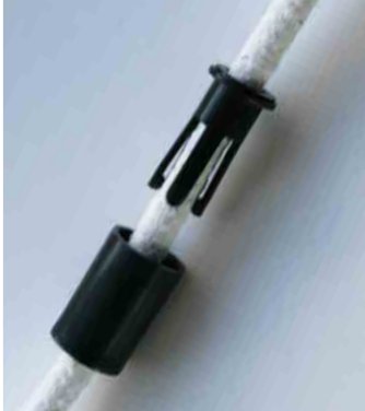
Close up of the brake itself unengaged and free to move

Sash Removal System (SRS) is discreetly mounted in the side of the sash, allowing safe and easy removal of both the upper and lower sashes, to therefore give free access to the window box frame, and is not visible either internally or externally during the normal operation of the sash window.