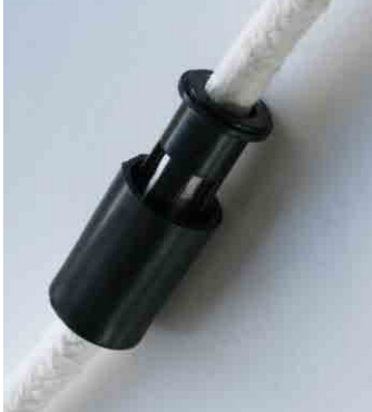
Close up of brake in it's engaged state