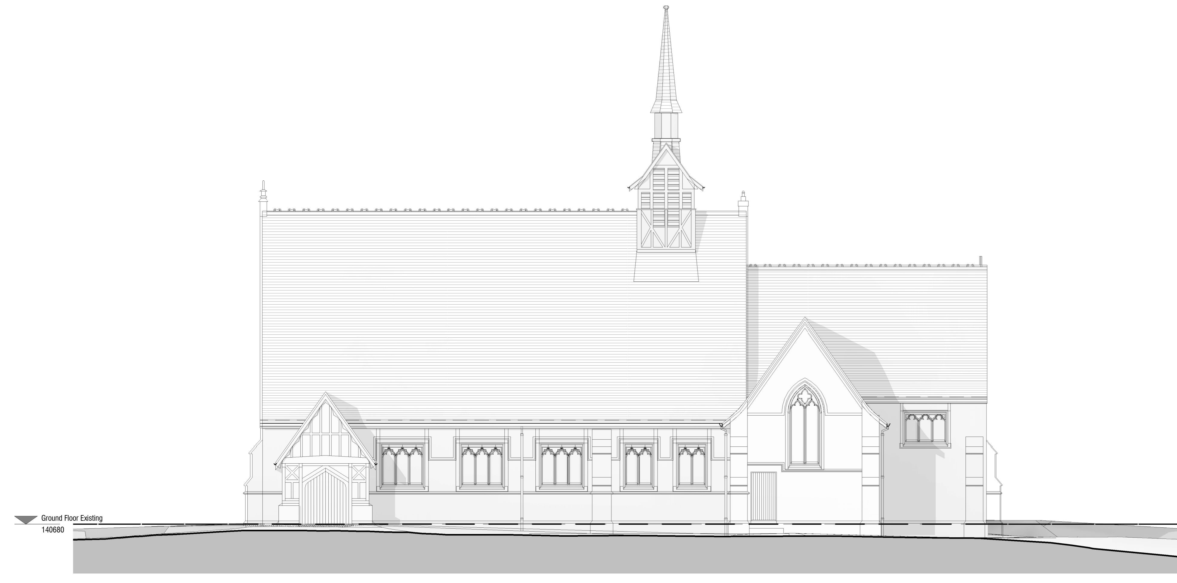
South Elevation as Existing 1 : 100