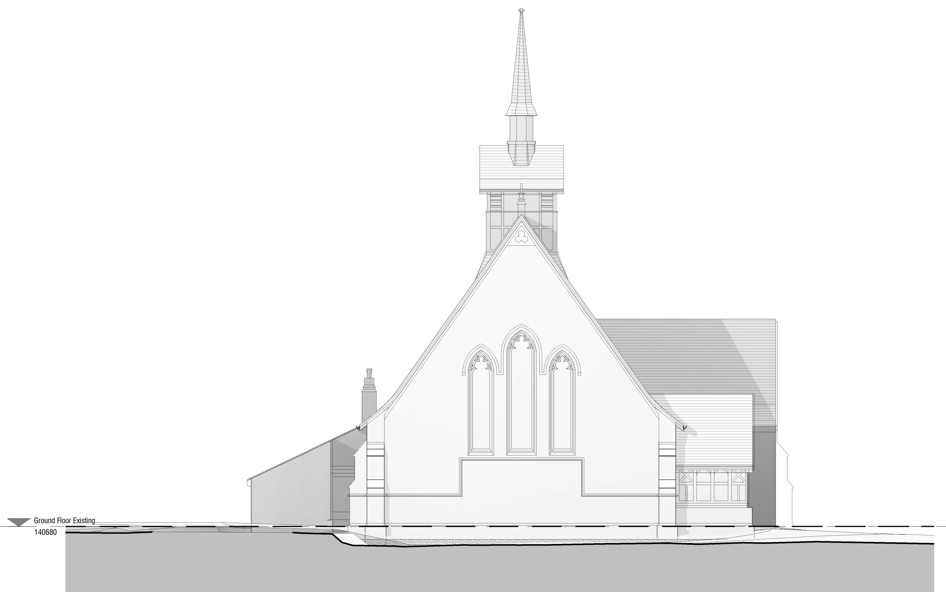
West Elevation as Existing 1 : 100

BYROM CLARK ROBERTS ARCHITECTS / SURVEYORS / ENGINEERS