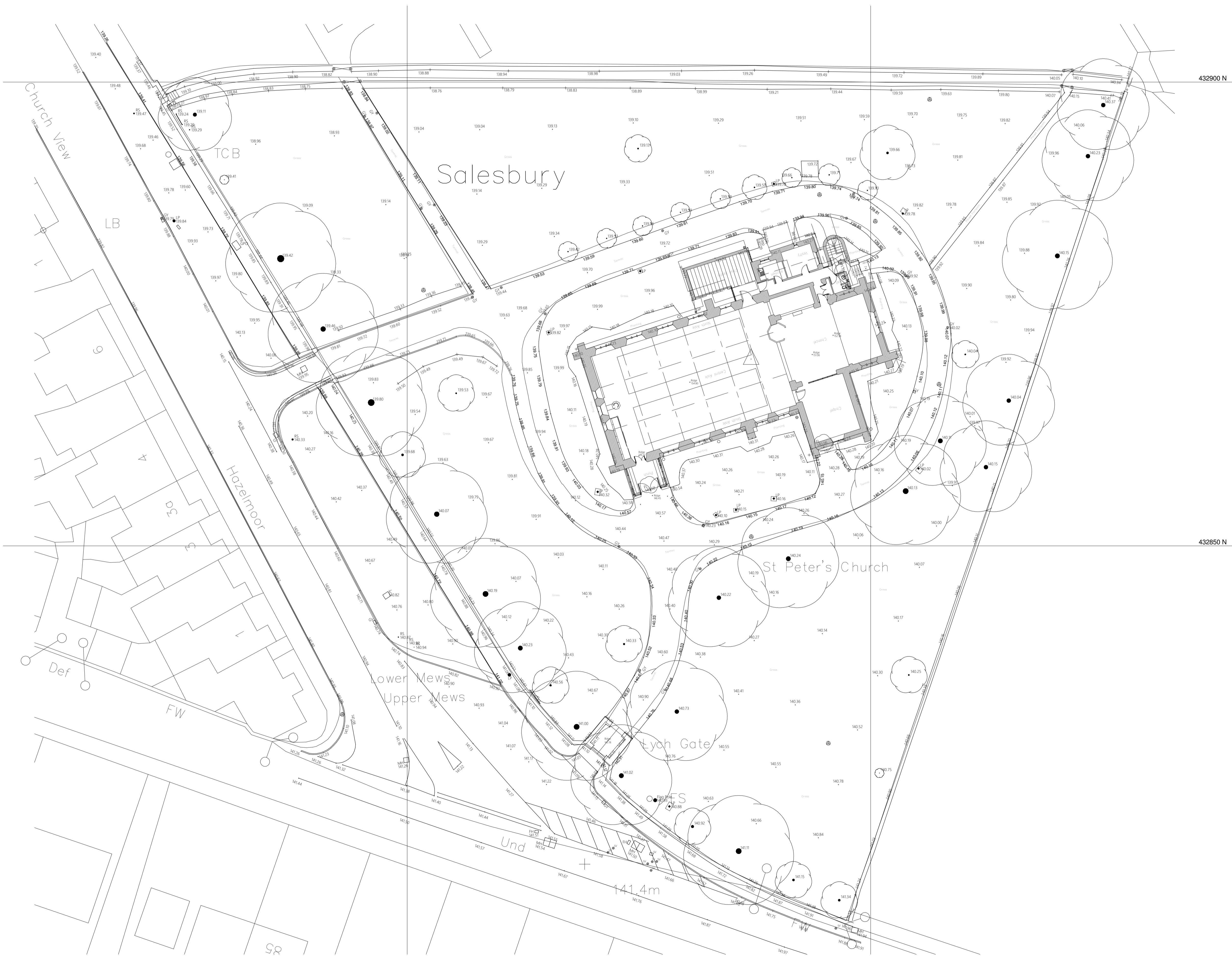
Site Plan as Existing 1 : 200

BYROM CLARK ROBERTS ARCHITECTS / SURVEYORS / ENGINEERS