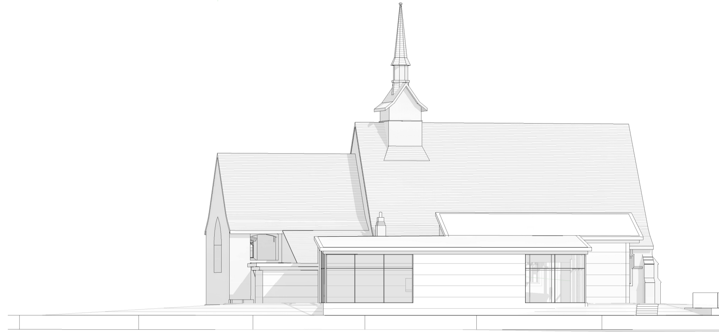
3D View North as Proposed