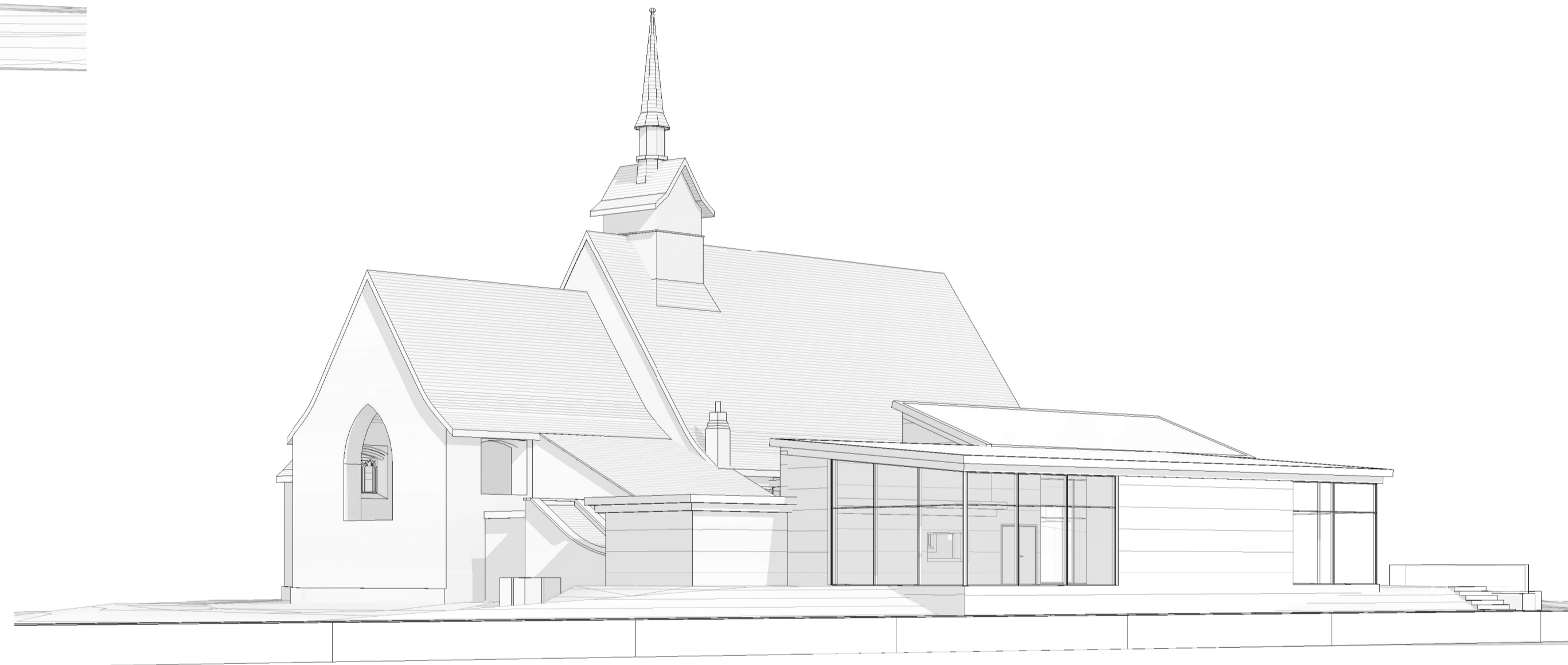
3D View from Salesbury Cricket Club as Proposed