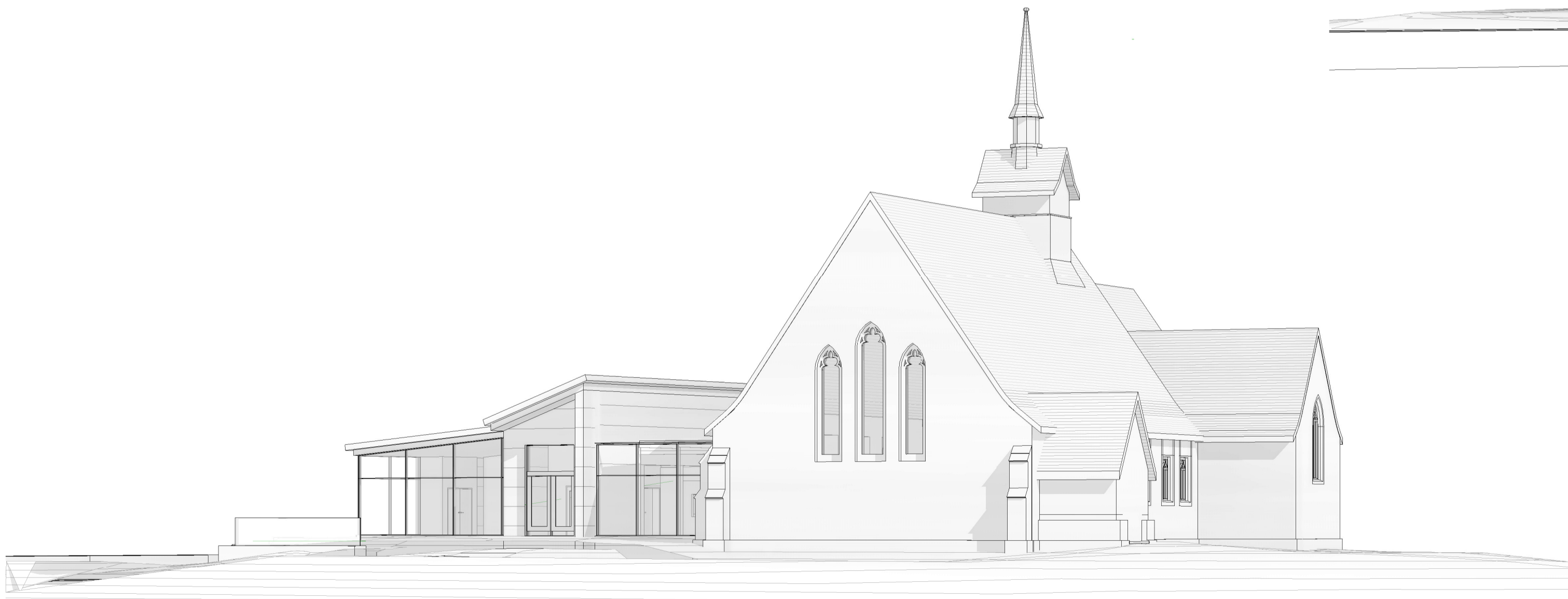
3D View from Lovely Hall Lane as Proposed