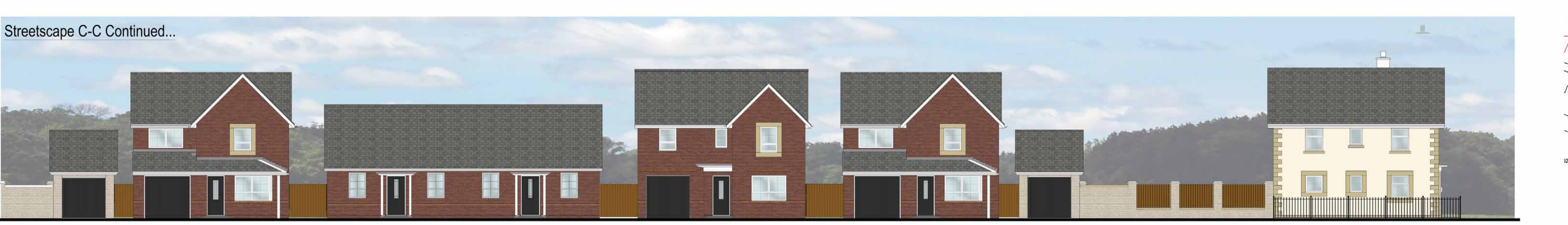
Plot 49 Ripon Plot 50 Bedale Plot 51 Bedale Plot 52 Ripon Plot 53 Andover Plot 33 Alderney