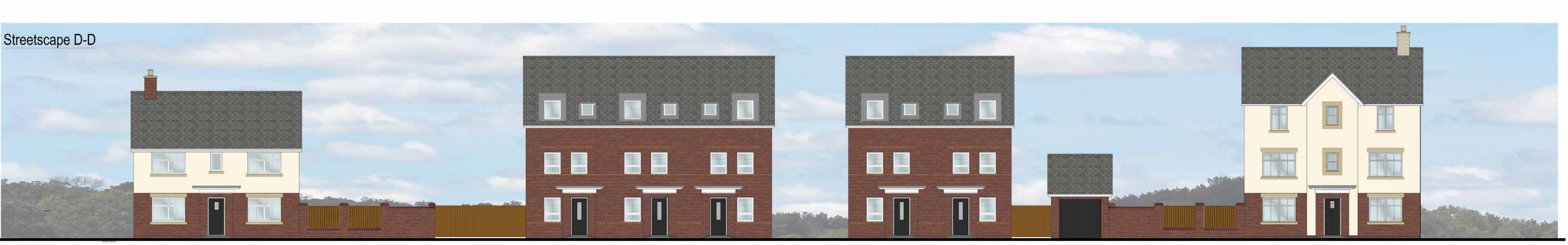
Plot 114 Ennerdale Plot 113 Norbury Plot 112 Norbury Plot 111 Norbury Plot 110 Norbury Plot 109 Norbury Plot 108 Brentford