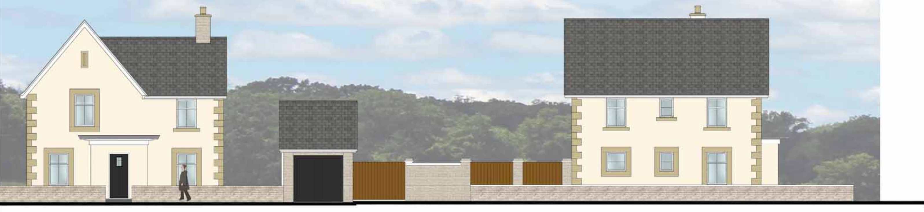
Plot 21 Lincoln Plot 20 Lincoln