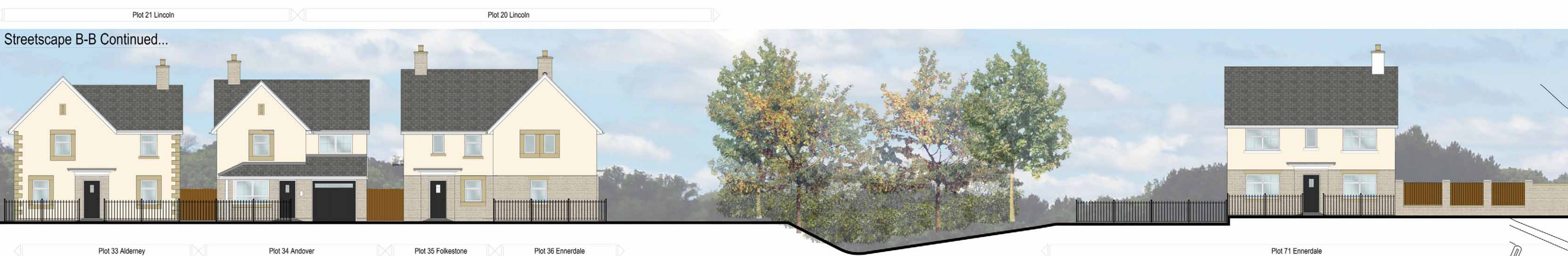
Plot 33 Alderney Plot 34 Andover Plot 35 Folkestone Plot 36 Ennerdale Plot 71 Ennerdale