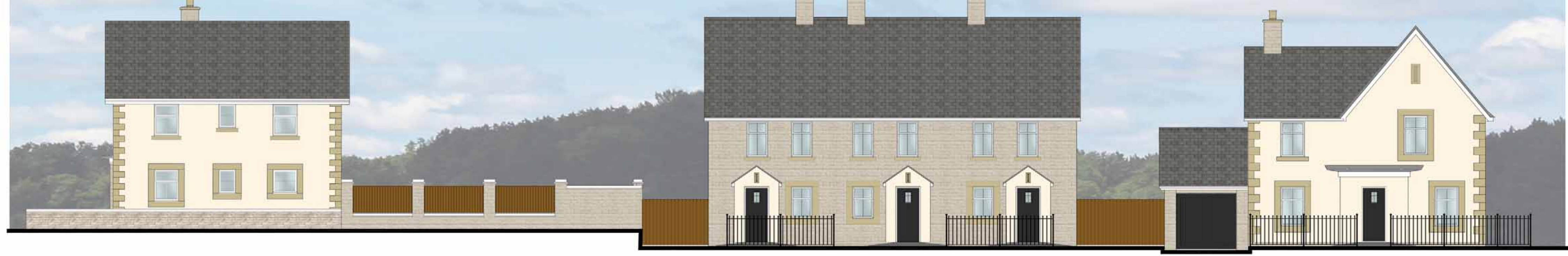
Plot 01 Alderney Plot 12 Duxford Plot 11 Duxford Plot 10 Duxford Plot 09 Lincoln