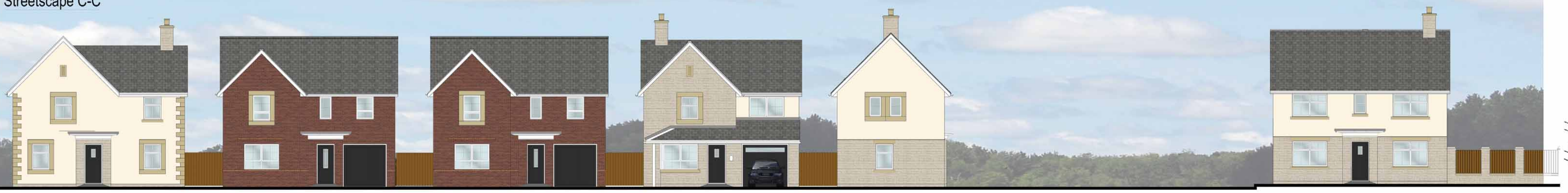
Plot 58 Alderney Plot 57 Halton Plot 56 Halton Plot 55 Andover Plot 54 Ennerdale Plot 48 Ennerdale