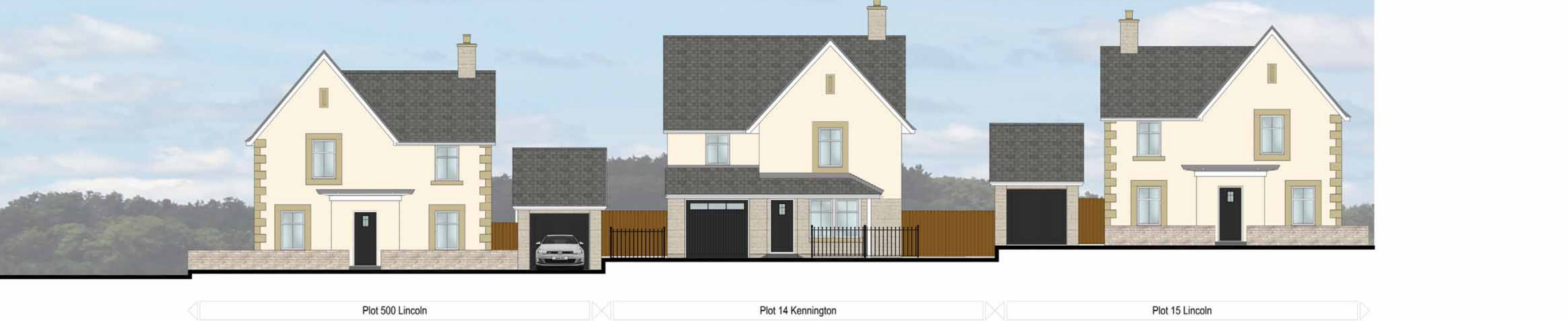
Plot 500 Lincoln Plot 14 Kennington Plot 15 Lincoln