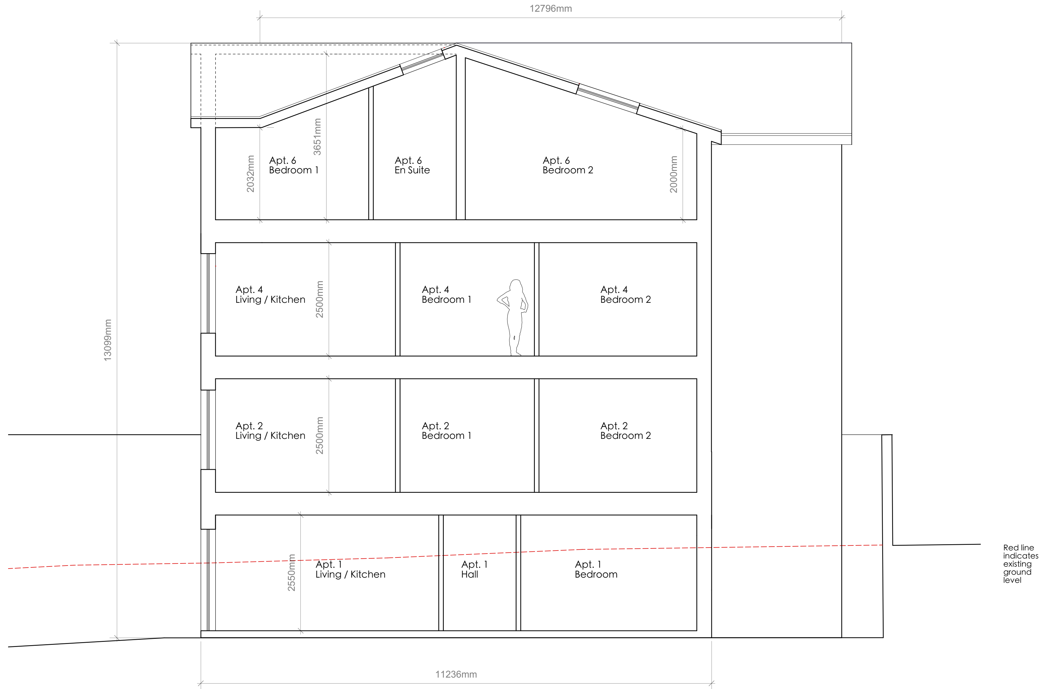
Proposed Section A