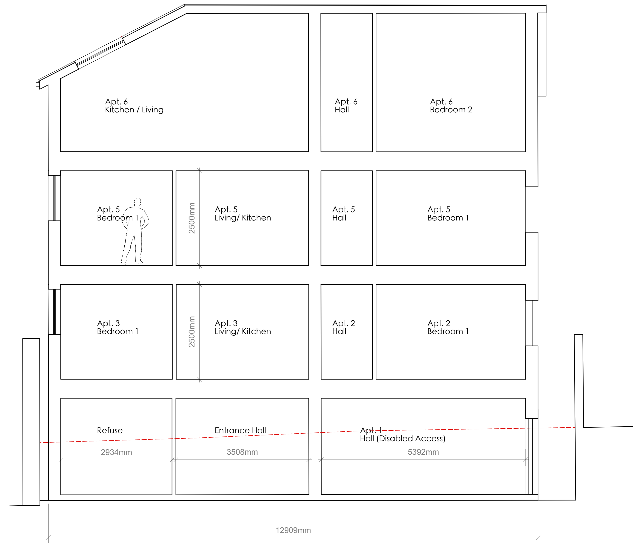
Proposed Section B