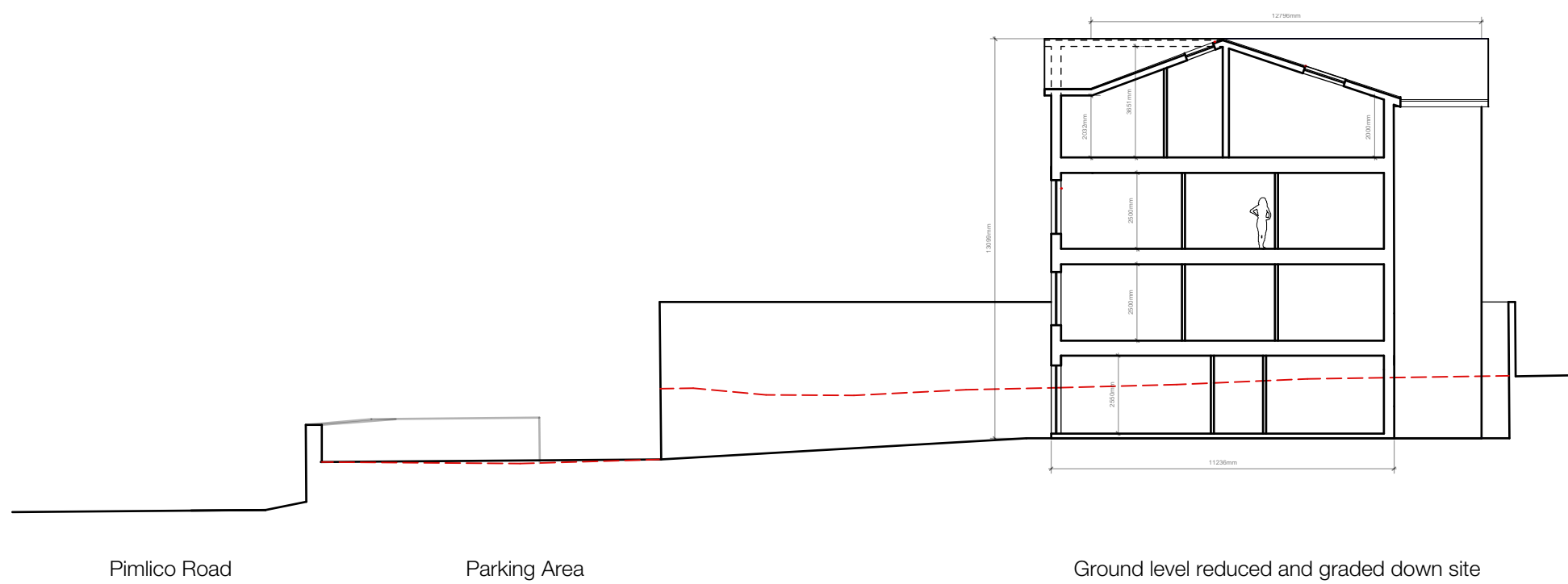
Proposed Site Section