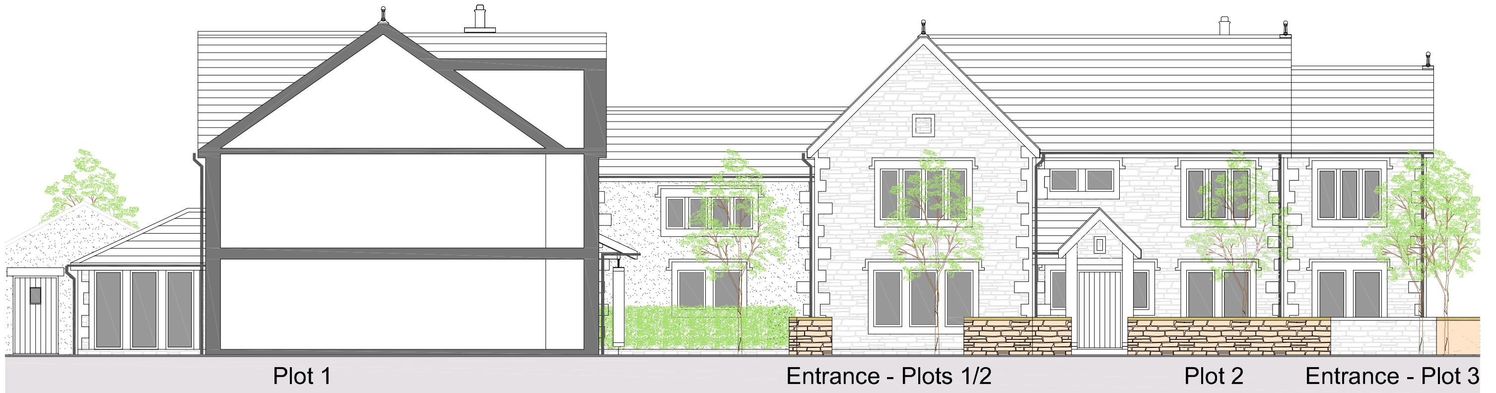
Sectional Elevation C-C