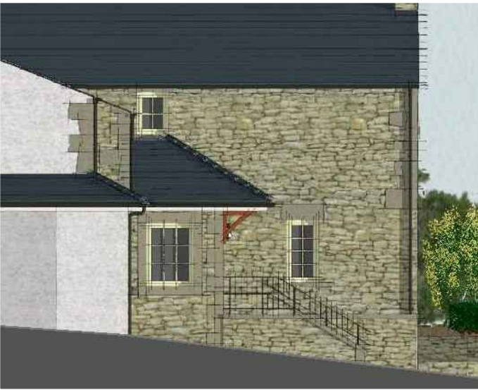
North East Elevation detail of Entrance Porch