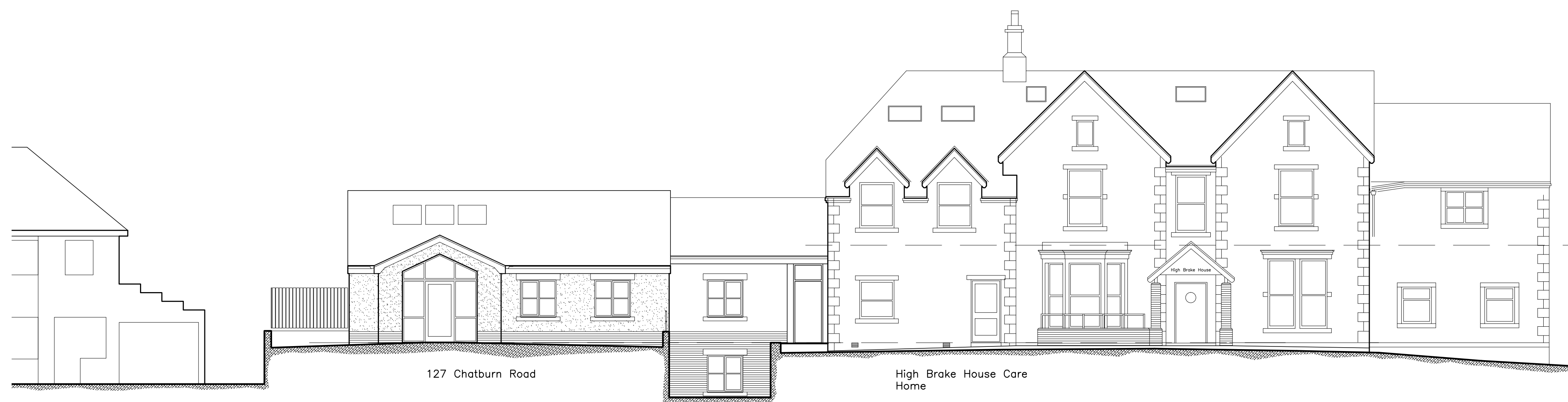
Front Elevation - North East