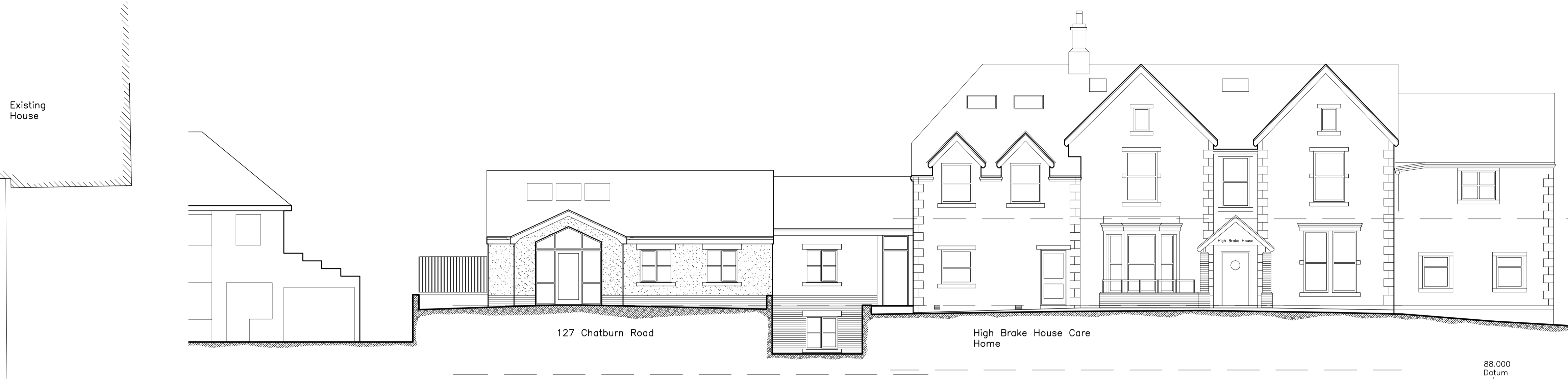
Front Elevation - North East