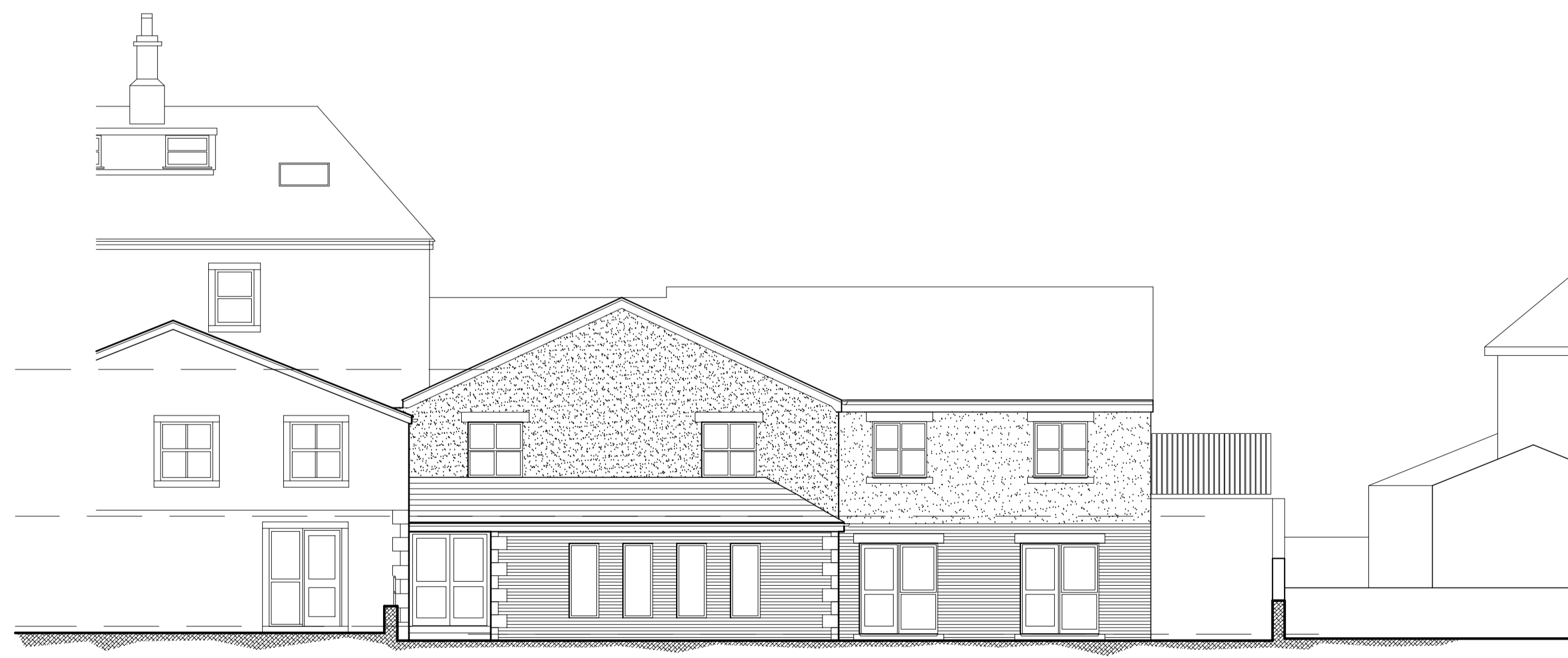
Rear Elevation - North West