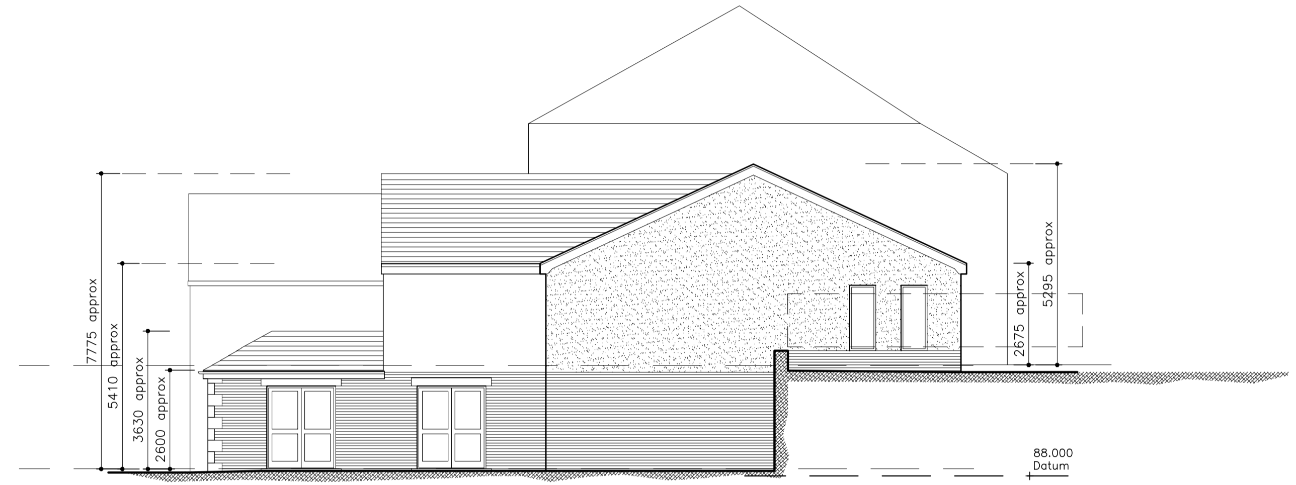
Side Elevation - South West