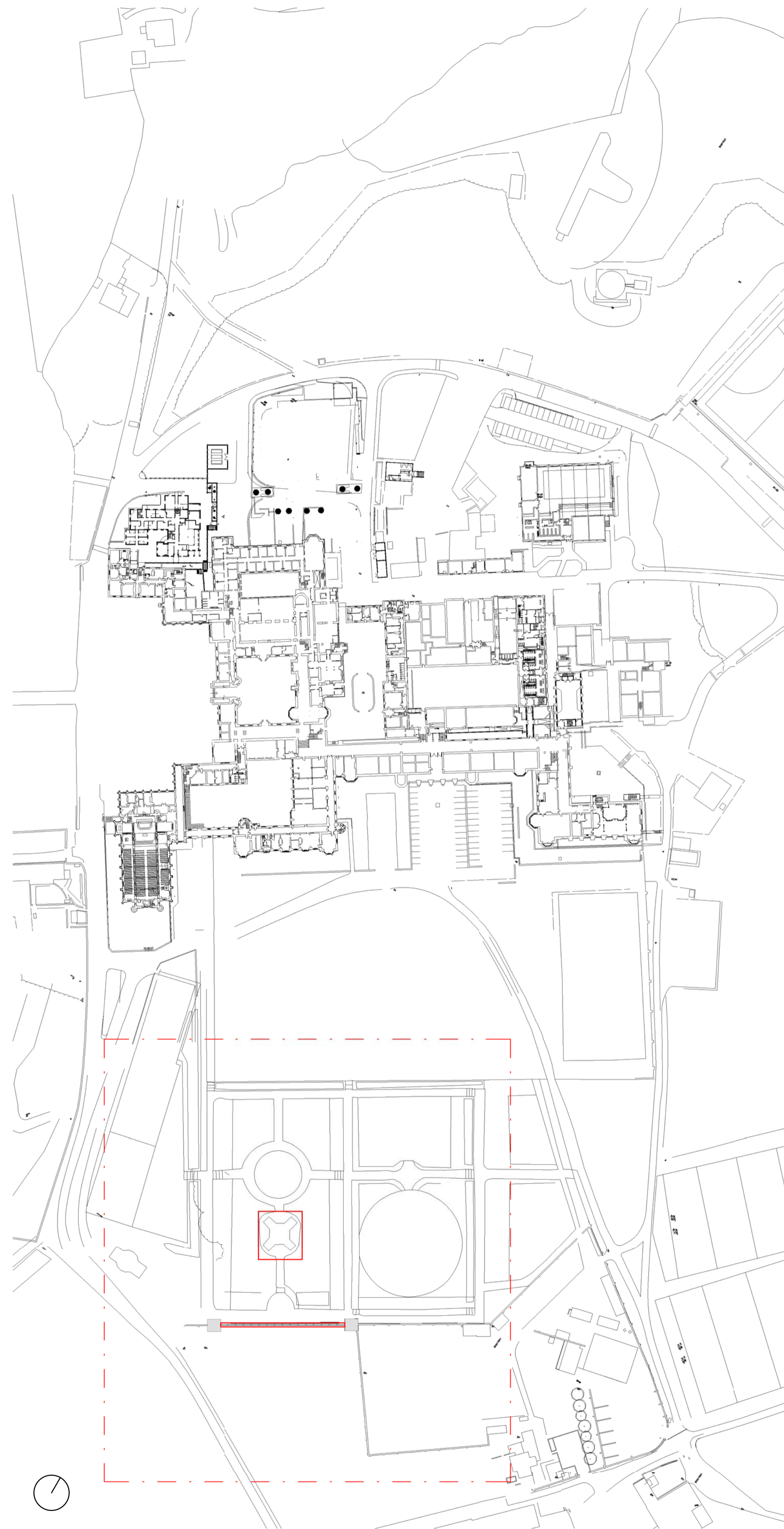
2 Location Plan 02 1 : 1250