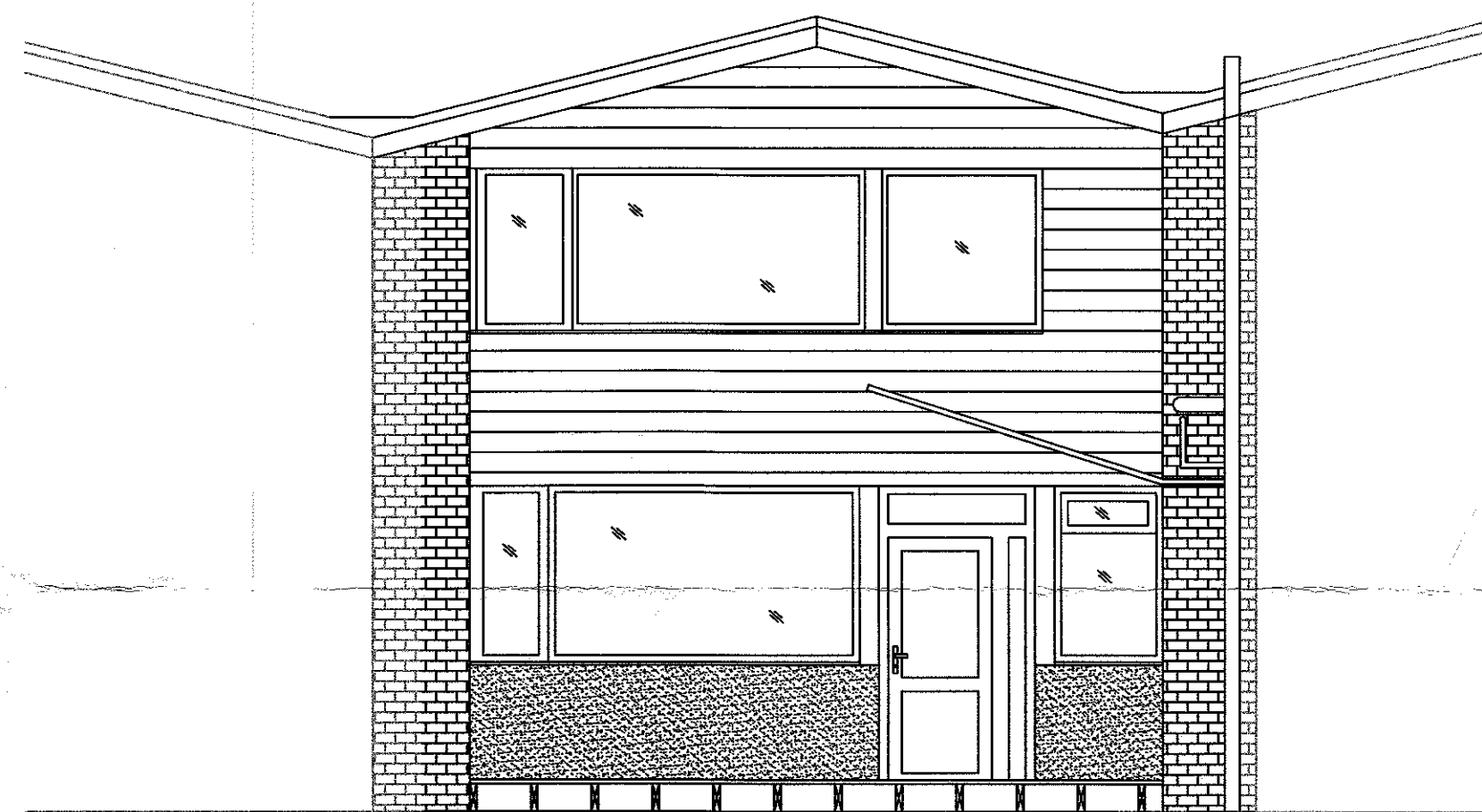
Existing Rear Elevation 1:50