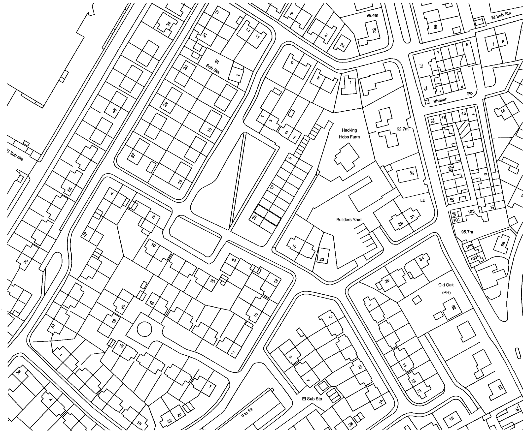
Existing Site Location Plan 1:1250