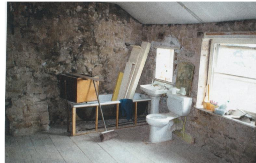
Above: image shows the original first floor bathroom (as it was in 1998) after the partition wall had been removed.