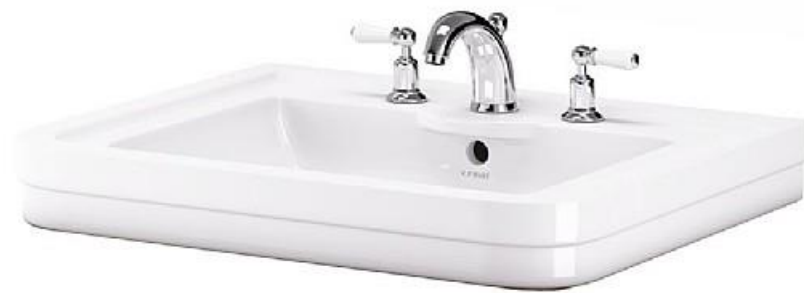
Bathroom fittings for the proposed bathroom