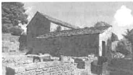
Figure 3: West elevation