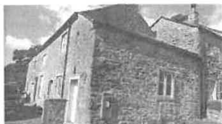
Figure 2: East elevation

Externally the house is well-pointed and the stonework appears to be secure, similarly both gable end walls are mortar-pointed and the roof verges are secure. The roof itself has many small gaps beneath the stone slates and roofing felt is completely absent. The rafter-with-purlin roof (figures 5 and 6) is likely to be of Victorian construction and now requires complete re-roofing to bring it up to modern specification.