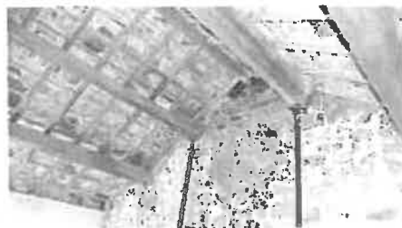
Figure 6: Internal wall / chimney