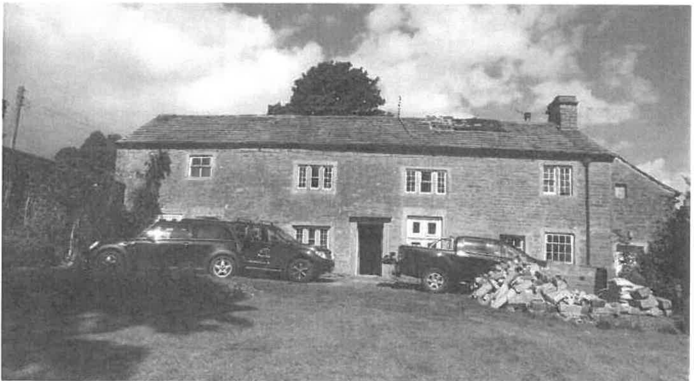
Figure 1: Front elevation