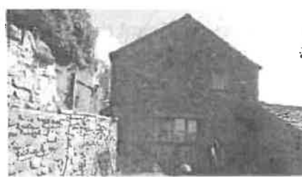
Figure 4: West gable end