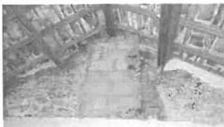
Figure 5: West gable apex wall internal