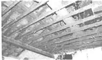
Figure 7: Roof in rear lean-to building