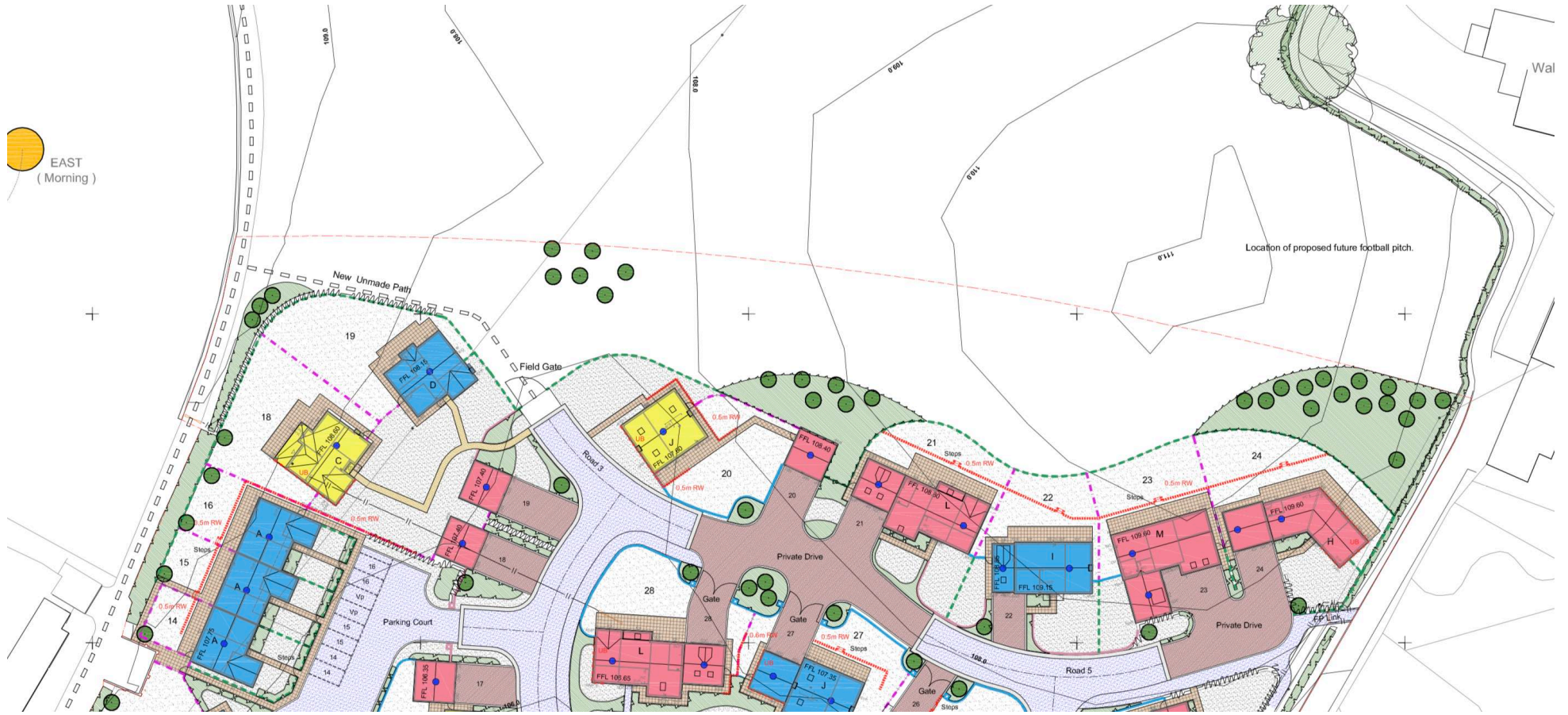
Current proposed arrangement with open boundary to North Gardens defined close to the houses with Steel estate fencing 500mm retention along rear patio area