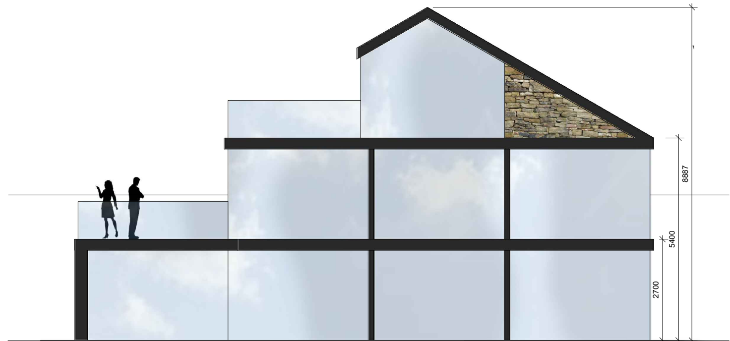
SIDE ( EAST ) ELEVATION