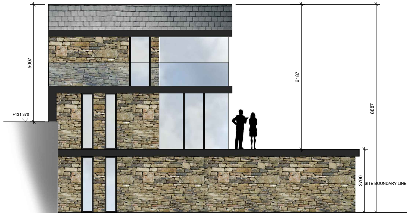
SIDE ( WEST ) ELEVATION