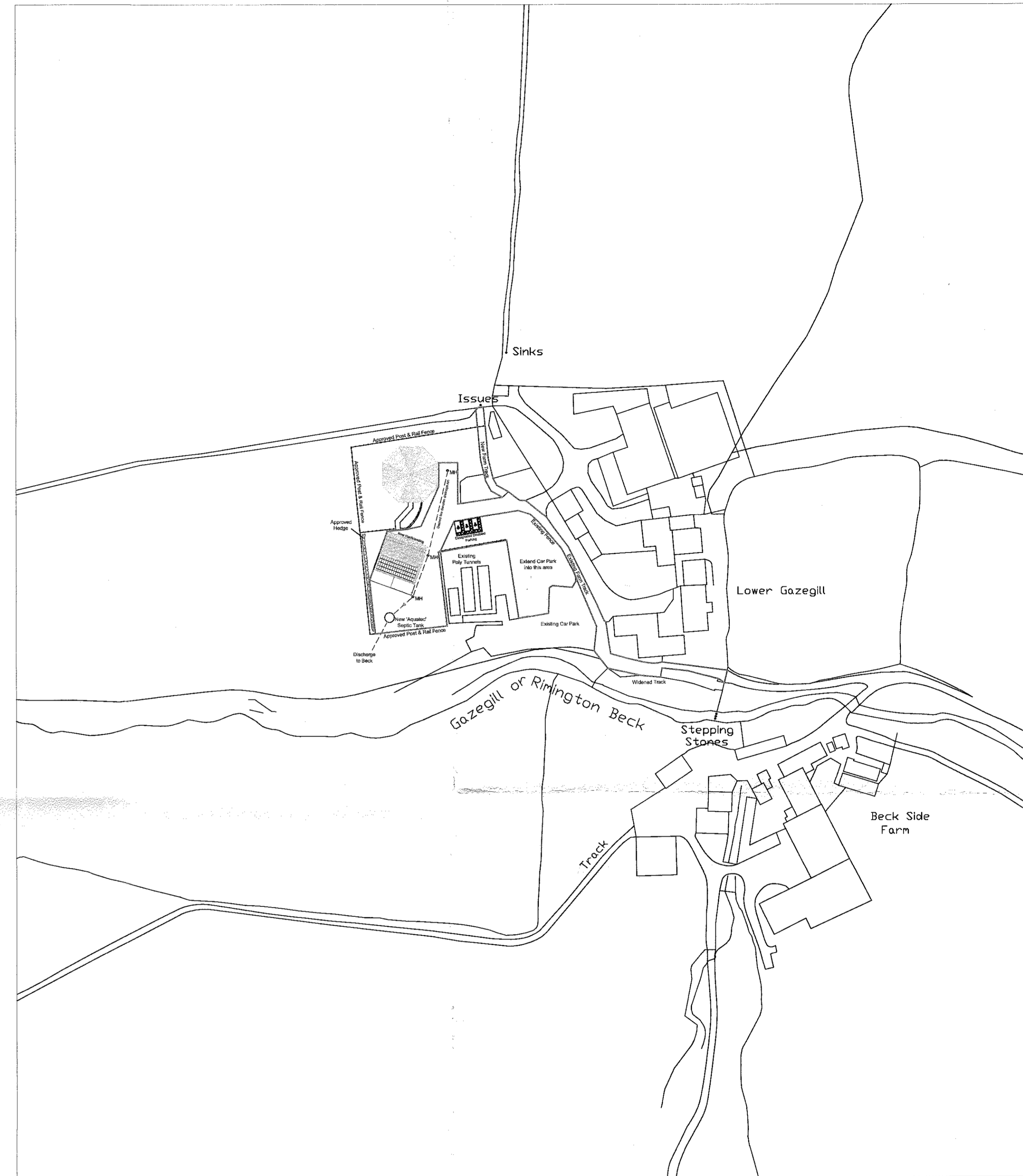
Location Plan - 1:1250