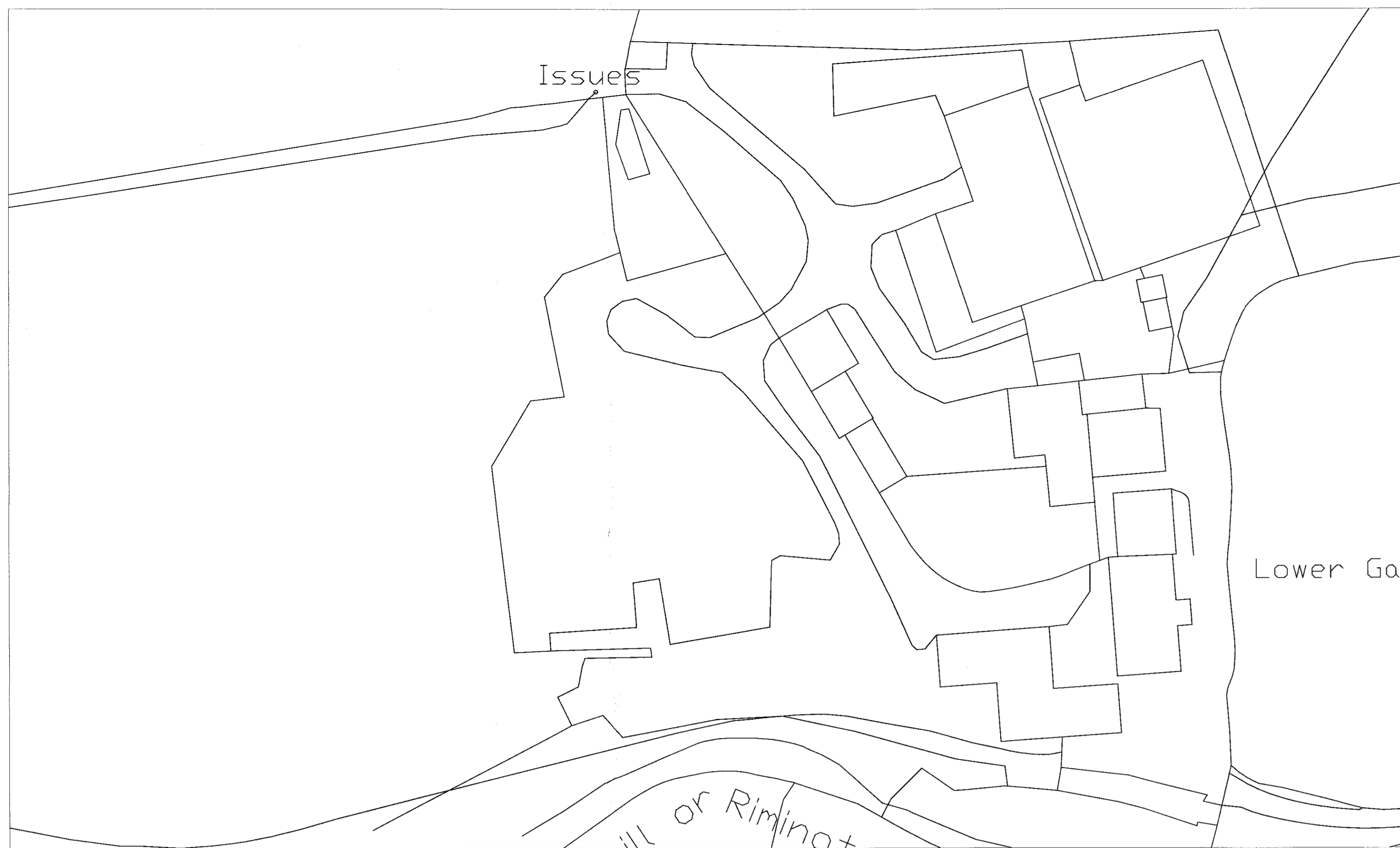
Existing Site Plan - 1:500