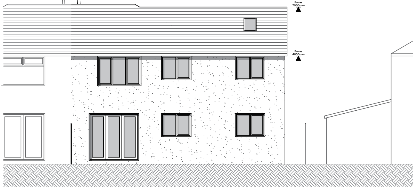
PROPOSED NORTH-WEST ELEVATION - 1:100