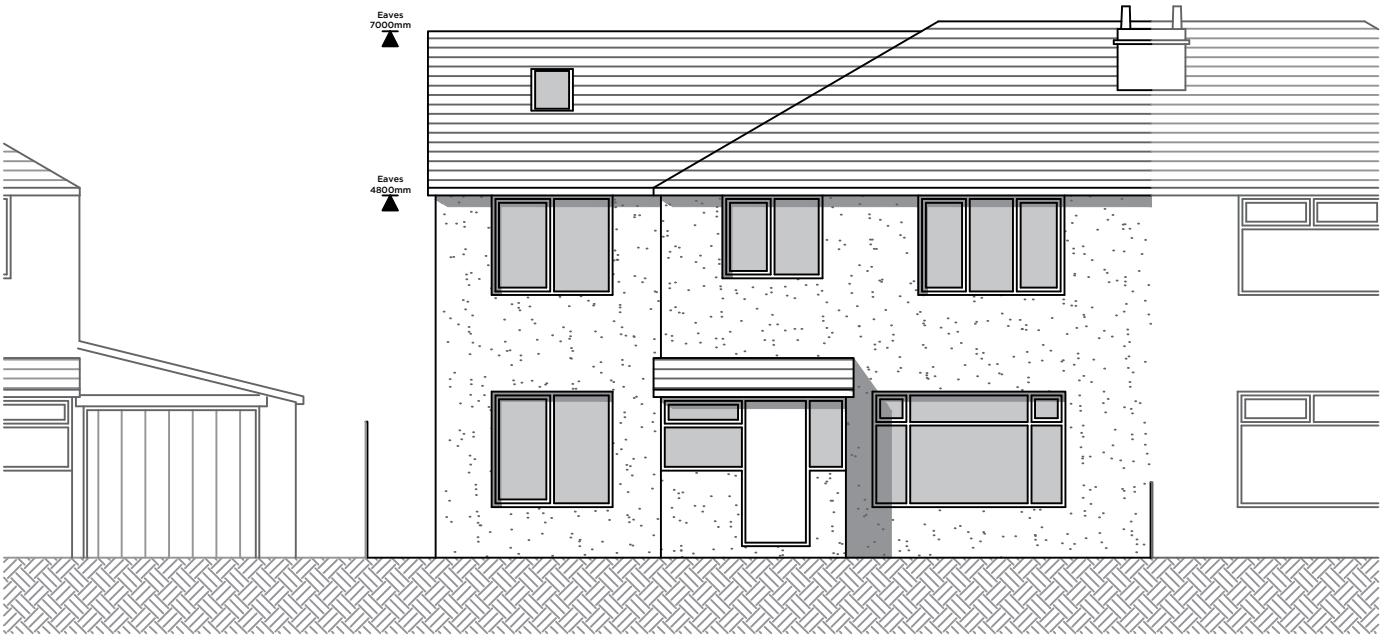
PROPOSED SOUTH-EAST ELEVATION - 1:100