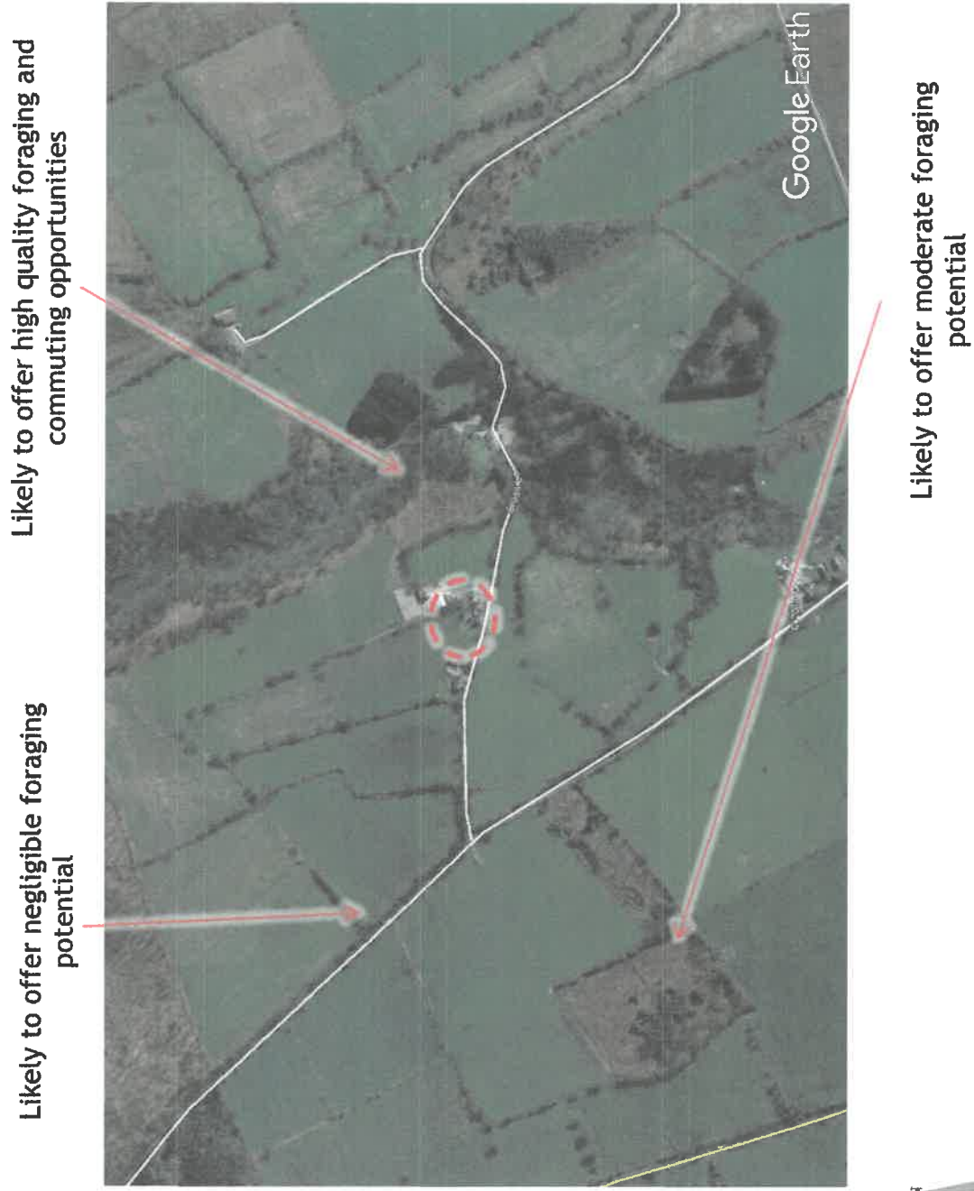
Figure 5 Habitat