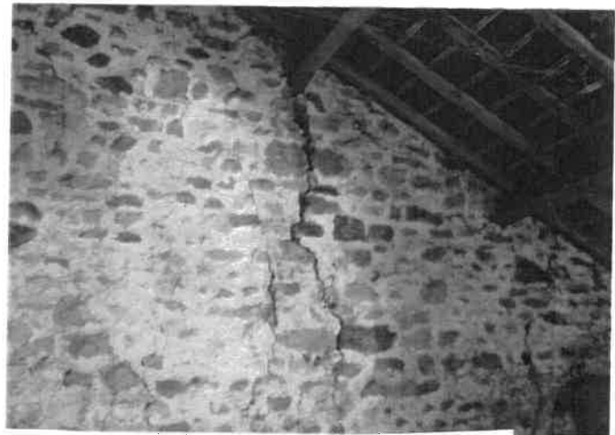
16. Roof from platform level, with cracks in wall.