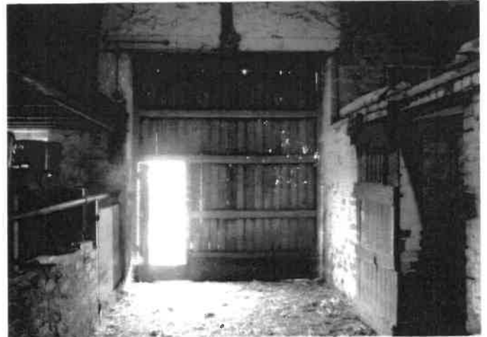
10. Inside main barn door.