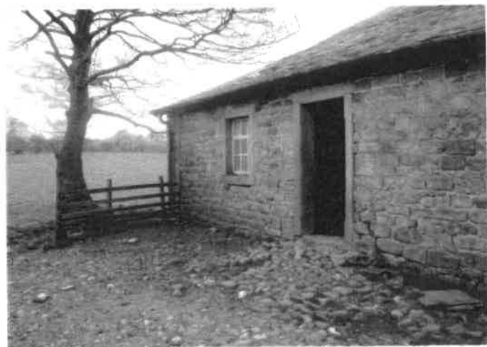
6. Rear facing NW.