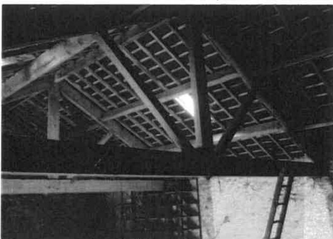
17. Roof with King Post trusses.