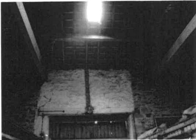
9. Inside main barn door.