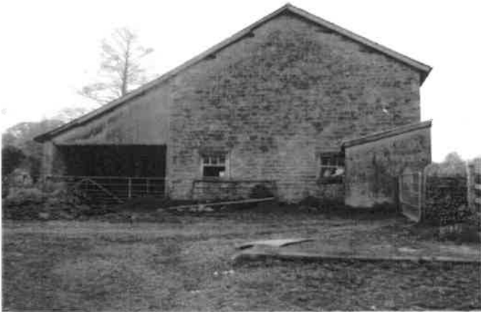
7. Side facing SW.