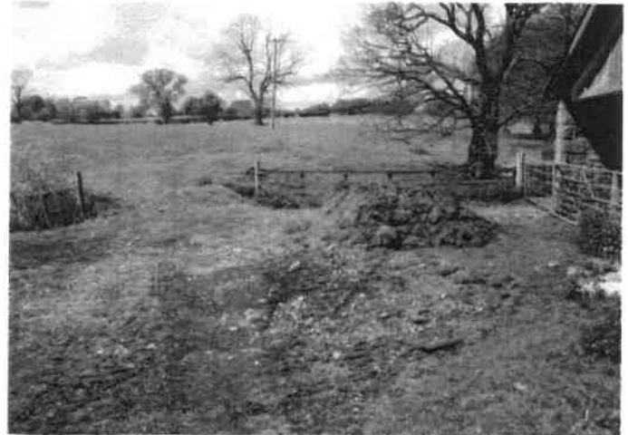
22. Side Yard Area