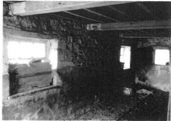
14. Boskins to the left hand side.