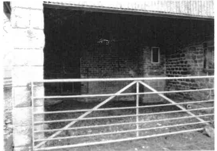
8. Side facing SW. of lean to.