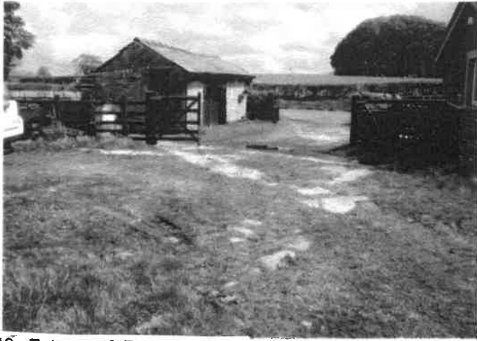
19. Entrance & Front Yard Area.