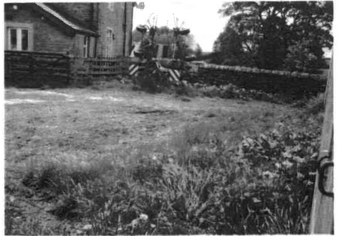
20. Front Yard Area.