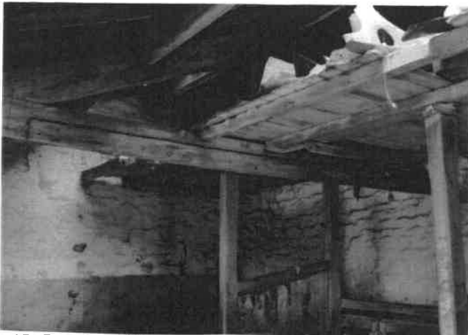
15. Boskins at the rear.