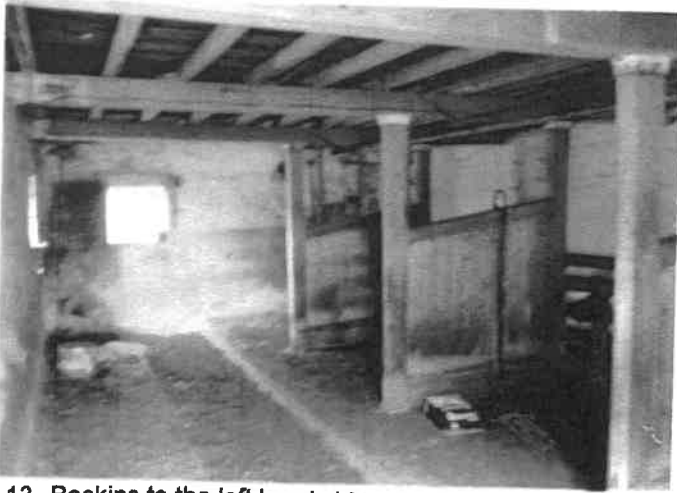
13. Boskins to the left hand side.