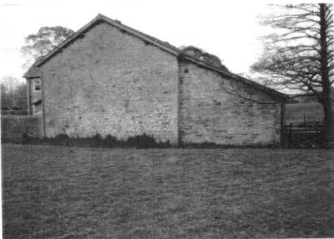
5. Side facing NE.