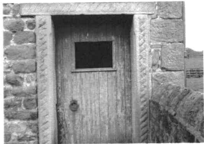
4. Stone detail for Jambes & head.