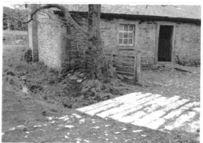
24. Side Field

Jeff Marshall & Associates Architectural Designers and Surveyors,