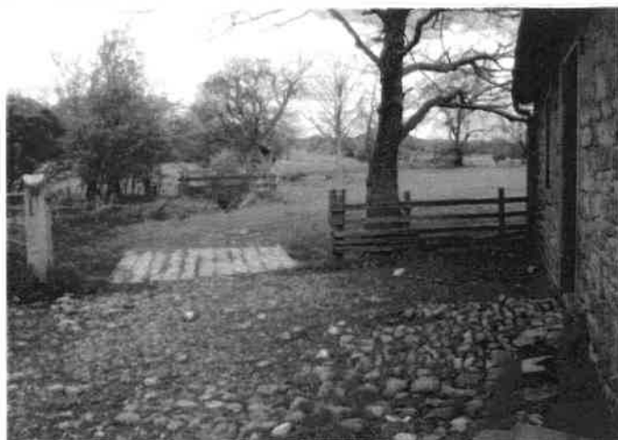
23. Rear Yard Area.