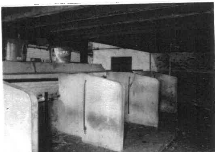
11. Boskins to the right hand side.