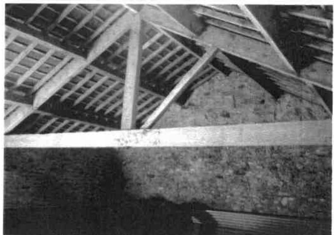
18. Roof with King Post trusses.

Jeff Marshall & Associates Architectural Designers and Surveyors,