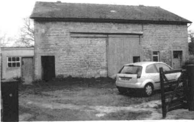
1. Frontage facing SE.