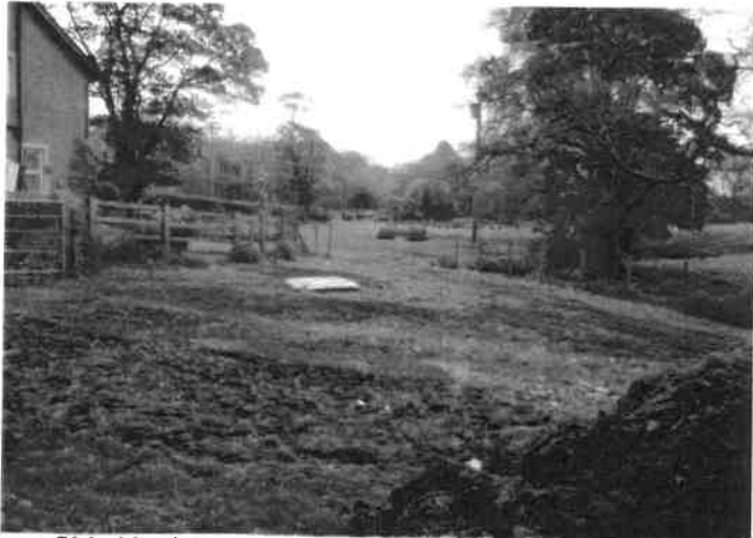
21. Side Yard Area.