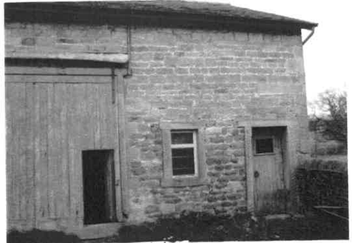
2. Frontage right hand side.