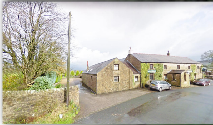
EXISTING ACCESS CLOSED OFF AND SYMPATHETICALLY LANDSCAPED