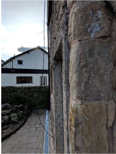
Figure 1 – Stone jamb, which is proud