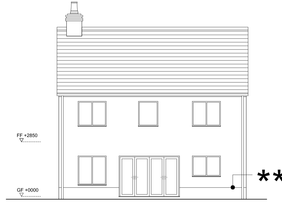
REAR ELEVATION - PLOT NO. 1, 24, 151, 154