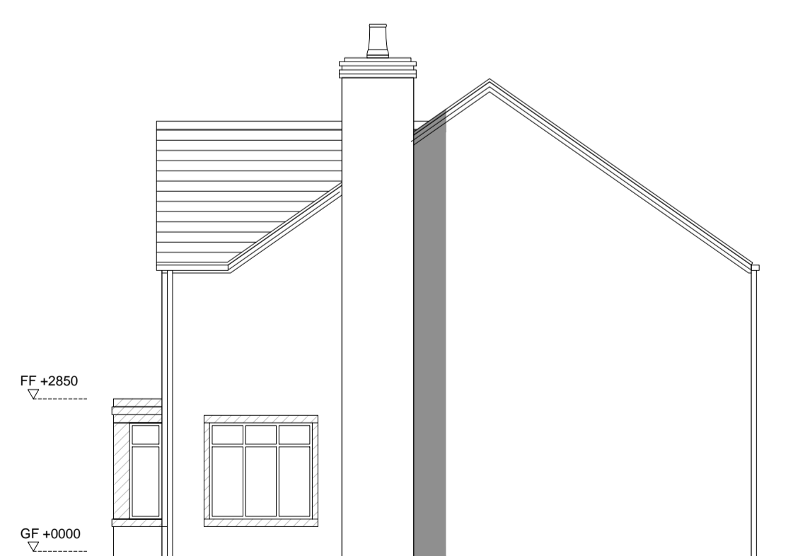
GABLE ELEVATION - PLOT NO. 30, 112, 118