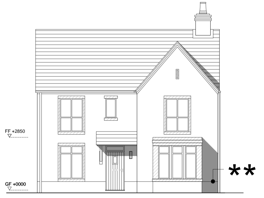
FRONT ELEVATION - PLOT NO. 1 (RENDER WITH DARK BRICK BASE, CHIMNEY AND DETAIL) PLOT NO. 24, 151, 154 (DARK BRICK)