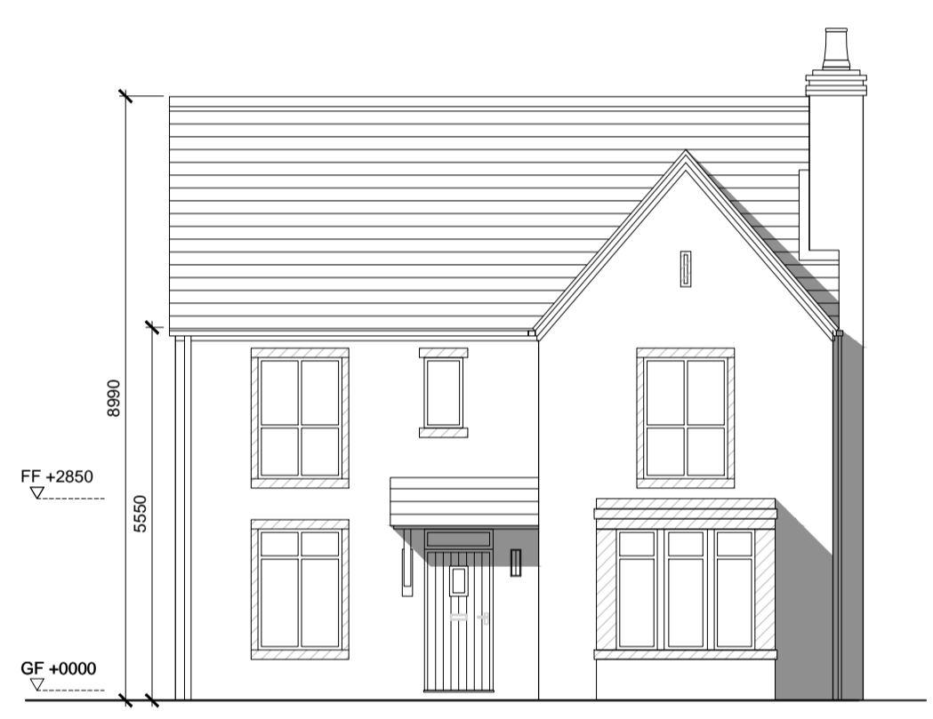
FRONT ELEVATION - PLOT NO. 30, 112 (STONE) PLOT NO. 118 (DARK BRICK)

HOUSE TYPE A (5B8P) Design Criteria: Building Regulations Category 1 (Visible Dwellings) Nationally Described Space Standards PLOT NOS. 1, 24, 30, 112, 118, 151, 154 NOTES: All bathroom and W/C windows to be opaque Gas and electricity meters are to be installed on the side elevation of all dwellings with the exception of terraces and in the most discreet location Rainwater pipes are indicative however on semi-detached and terraced dwellings a RWP is to be located on the party wall line of all front elevations to provide a visual break between plots For handing see drawings AA7403 2010 and 2011 Ridge and eaves heights shown are subject to a limit of deviation +/- 150mm * For location of chimneys see front elevation plot numbers ** Material joint line to rendered plots only Reconstituted stone elements