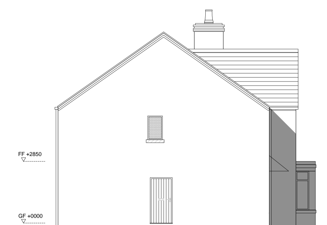
GABLE ELEVATION - PLOT NO. 30, 112, 118