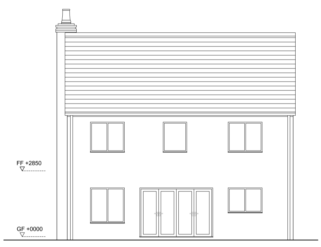
REAR ELEVATION - PLOT NO. 30, 112, 118