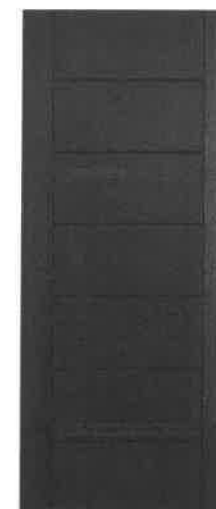
External Door North West Elevation