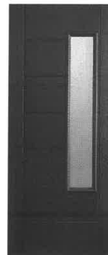
External Door North East Elevation