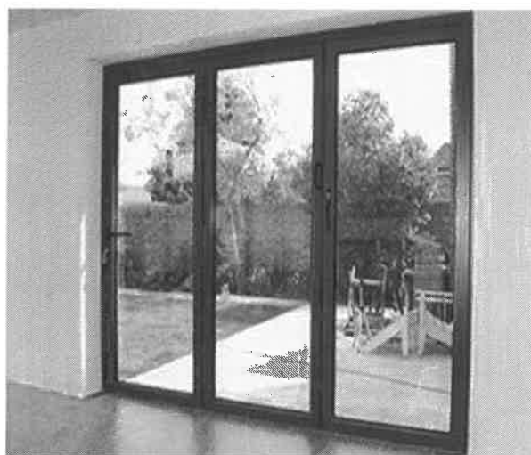
Bifold Doors South West Elevation