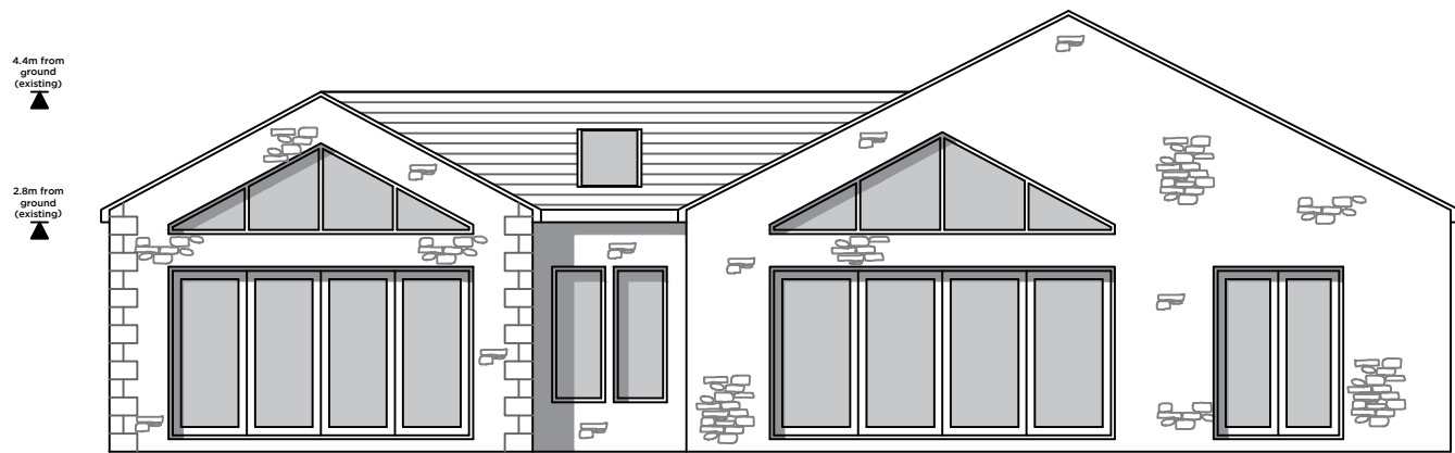
PROPOSED SOUTH-WEST ELEVATION