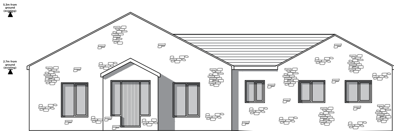
PROPOSED NORTH-EAST ELEVATION